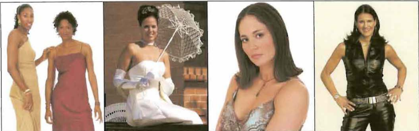
Lisa Leslie & Swin Cash