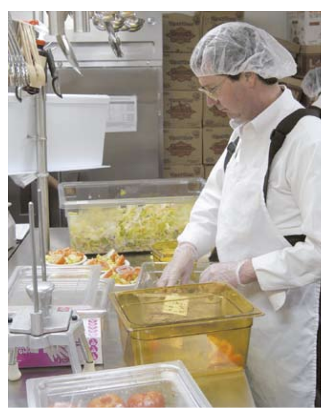
Good sanitation in food preparation areas is key to a successful pest management program.

Examples of pest-management objectives include (1) controlling pests that are found in the facility to prevent interference with learning, (2) eliminating possible injury to students and staff, and (3) preserving the integrity of buildings.