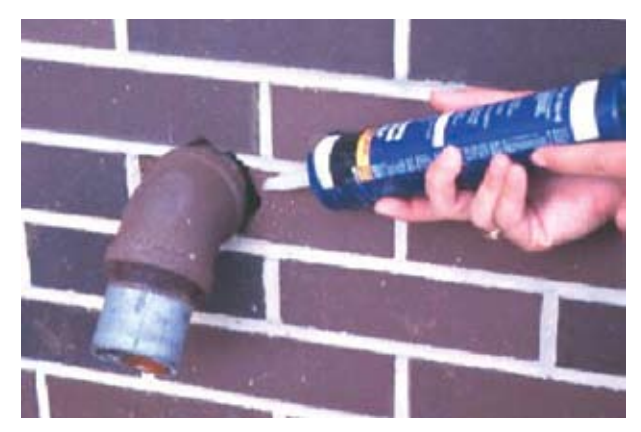
Sealing entry points can prevent pests from getting inside.

Accurate record keeping allows the PMP to evaluate the success of the IPM program. Records also help in forecasting the appearance of seasonal pests to predict future pest outbreaks.