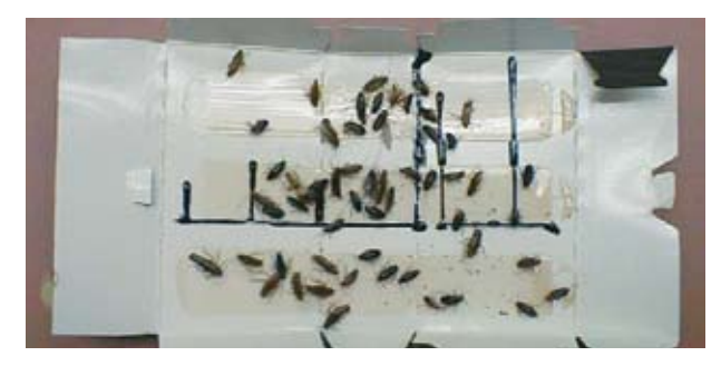
Glue boards or sticky traps are ideal ways to monitor pests.

The mere presence of one insect does not always require the application of a pesticide. The PMP and school staff should decide in advance how many pests are harmless and how many require control.