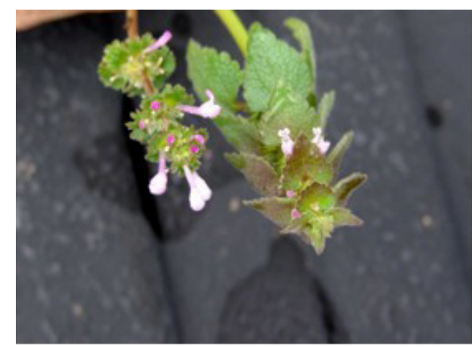
Henbit (left), purple deadnettle (right)