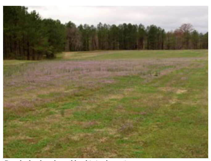
Purple deadnettle and henbit in the spring

Henbit is an herbaceous winter annual commonly found throughout the temperate regions of the world. It is native to Eurasia and can grow to heights of 15 inches. The cotyledons of henbit are oval and the hypocotyl is green and smooth, becoming purple in color. Leaves are green, opposite, circular to heart-shaped and have rounded teeth at the margins. They can appear to be three-lobed. Upper leaf surfaces appear to be crinkly. Leaves have hairs on the upper