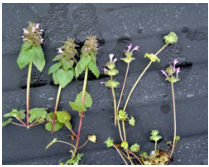
Purple deadnettle (left), henbit (right)

when not in competition with a wheat crop. Though they are called dead nettles, they have no sting. Henbit has been reported to produce 200 to 2000 or more seeds per plant. The oil from henbit seeds has shown antioxidant properties. Young henbit has been used in salads and as a potherb. Henbit is an alternate host for corn earworm and an overwintering host for two-spotted spider mites in areas of the southern U.S. In a recent survey, henbit was listed as one of the 10 most troublesome and 10 most common weeds of wheat and small grains in the southern U.S.. Henbit seeds are consumed by some species of birds.