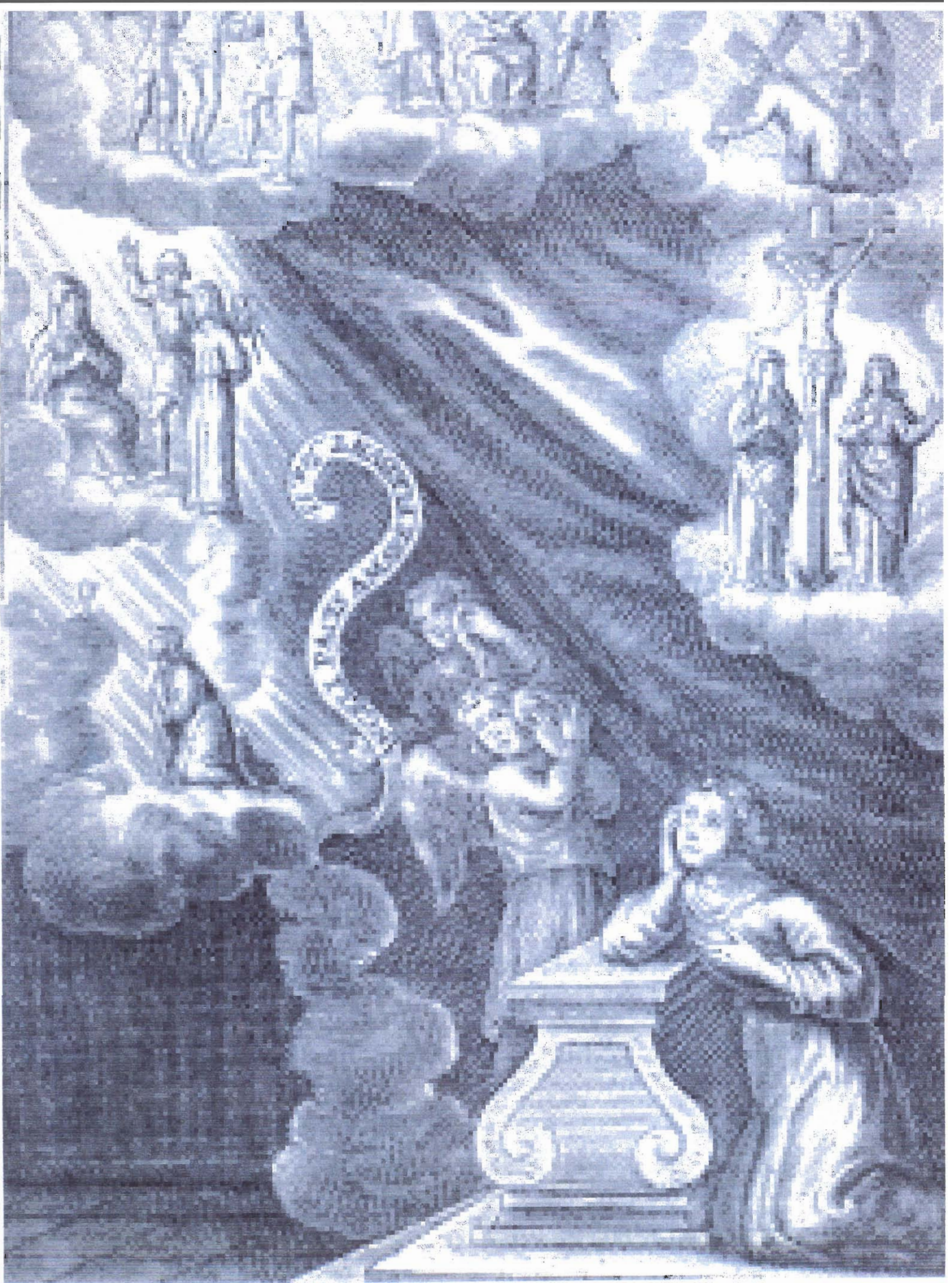
A Pictorial Representation of Jesuit Meditation