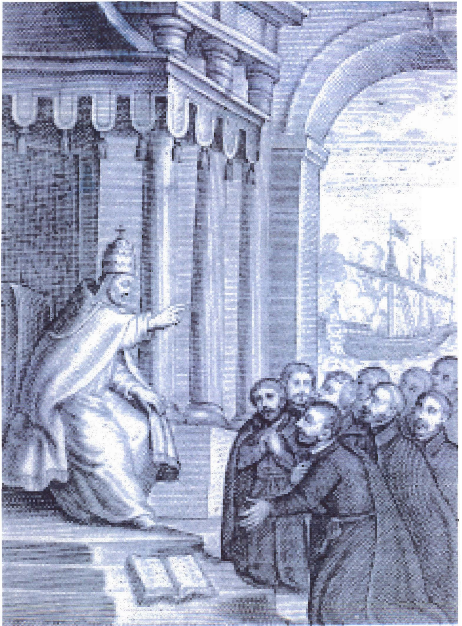
Pope Paul III Giving His Blessing for Ignatius and his Companions' Pilgrimage to Jerusalem