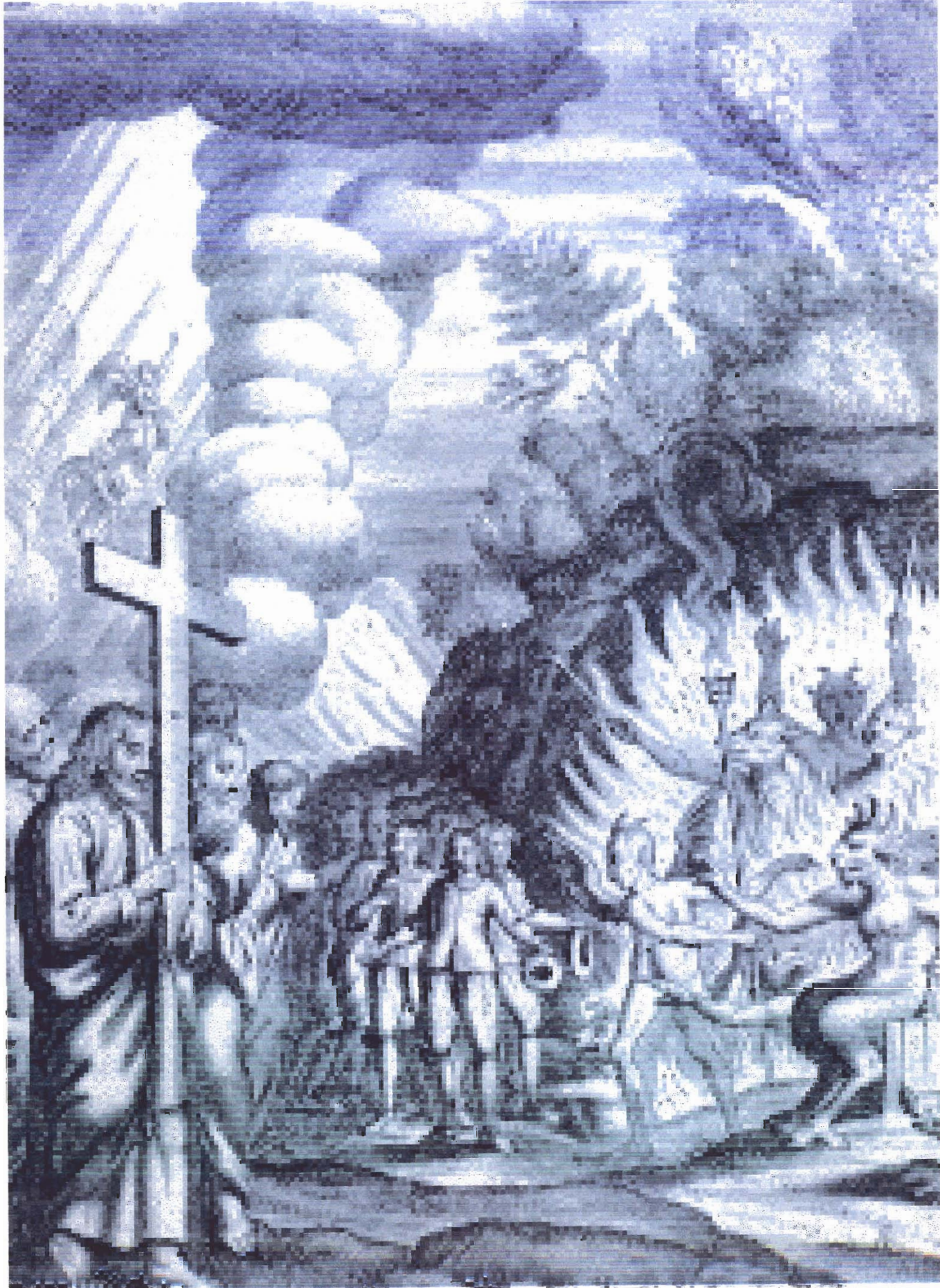
A Depiction of the Two Standards