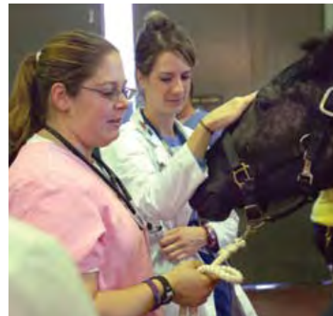
UTCVM faculty and staff wish Pattycake well on her release from CVM.