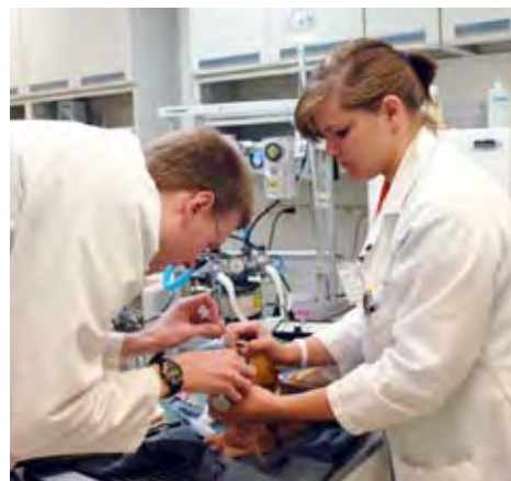
UTCVM's newly opened Dental Suite.