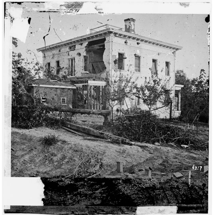
Ponder House

The traditional Atlanta story arc involves a young man or woman of unusual ability who moves to the big city and amasses a fortune in real estate, soda pop, or hair products. This story begins, not at the beginning of a brilliant career, but at the end of one.