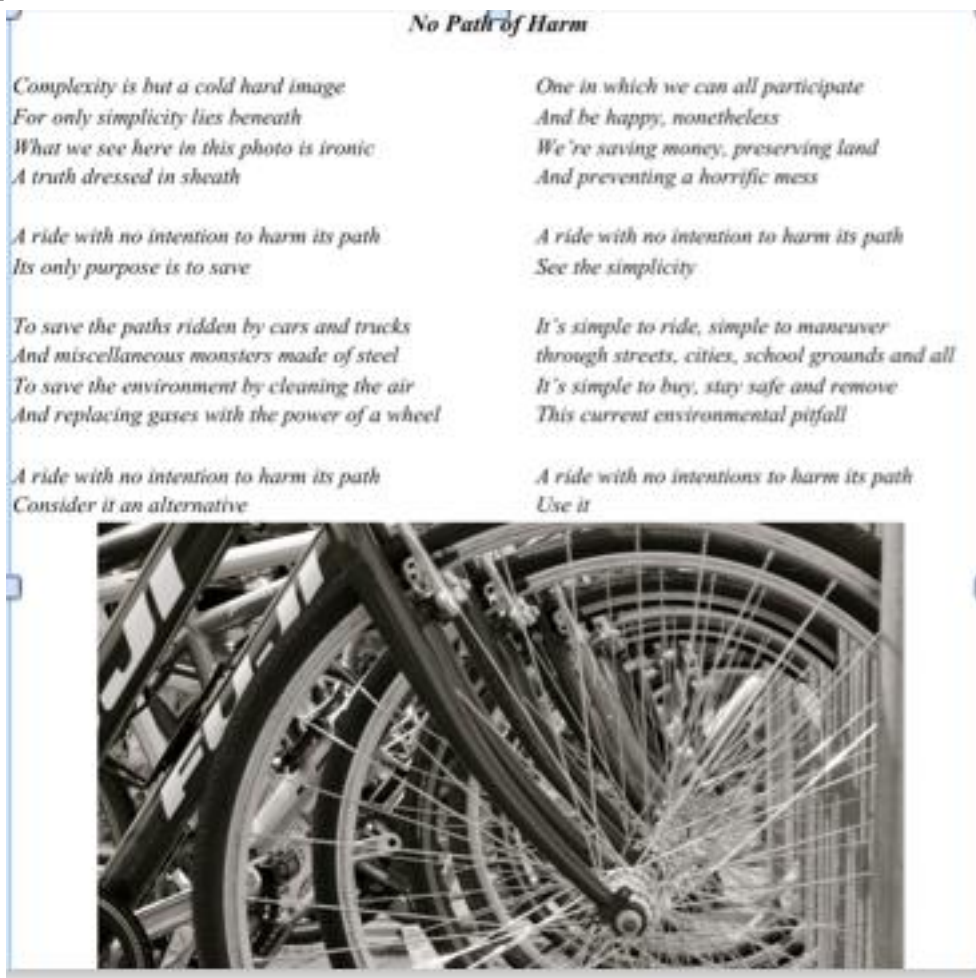
Figure 1. A student from Middletown describes personal reasons for caring about bicycling on campus