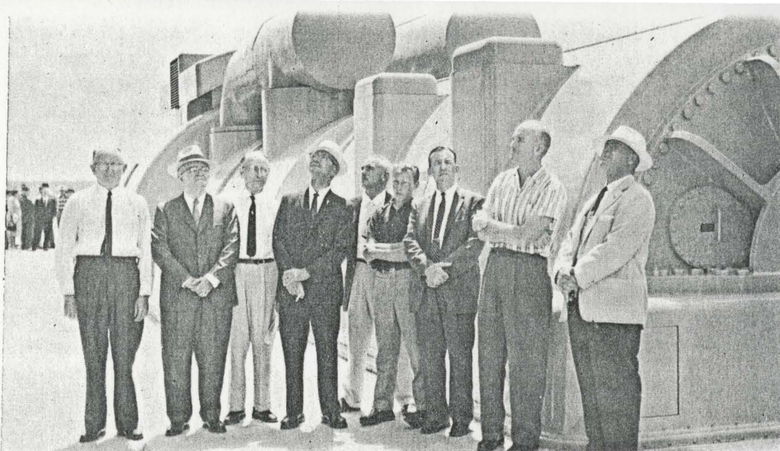
BETWEEN THESE TWO groups of guests who toured the plant on dedication day is the 250,000-horsepower generator that will produce well over a billion kilowatt-hours annually, enough electricity to supply 300,000 average homes.

TS ARE SHOWN the plant's pulverizers that up" 26 rail carloads of coal daily.