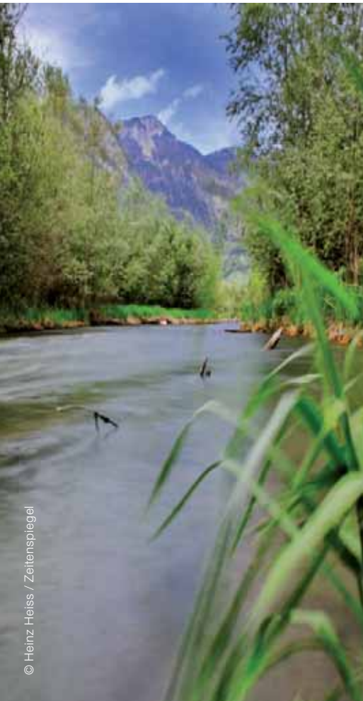
Picture 3: Only scarcely ten percent of the length of the most important Alpine rivers is in natural or near-natural state.

The constraints imposed on all water uses are significant: many will need to be limited and numerous other pressures, such as pesticide pollution, should decrease or disappear. Significant flows will be returned to rivers and many artificial management schemes will require dismantling or adaptation. Effort will be directed at restoring natural habitats and ecological functions, accompanied by a boost in demand for ecosystem services, perhaps introducing fundamental changes in land use patterns. The requirement for full cost recovery – including environmental externalities and resource scarcity – is likely to have significant impacts. Demand is not to be considered simply as a need to be satisfied regardless of cost. Potential value is to be weighed up against full cost and, as far as possible, this cost passed on to the user.