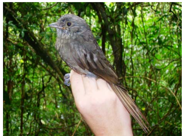
Figure 3. Lipaugus lanioides is an endemic species of Atlantic forest occurring at Ilha Grande, state of Rio de Janeiro, Brazil.

Atlantic forest remnants at Ilha Grande, as well as Itatiaia (states of Rio de Janeiro and Minas Gerais), can be two remarkable Atlantic forest remnants for Pyroderus scutatus , whose populations are much reduced in Southeast Brazil (Sick 1997).