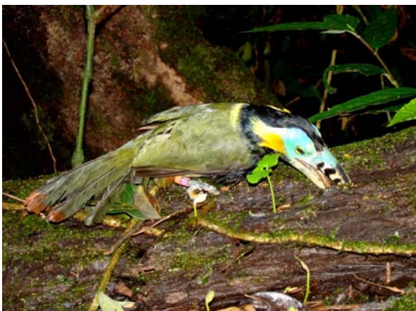
Figure 4. Selenidera maculirostris is an endemic species of Atlantic forest occurring at Ilha Grande, state of Rio de Janeiro, Brazil.

most frequently captured in the understory of the least disturbed forest during these systematic long-term studies (Alves 2001; Alves 2007). This kind of data allows evaluations of the population numbers over the years and between years (Alves 2007). Other species frequently captured and recorded based on sightings or vocalizations were Chiroxiphia caudata (Shaw & Nodder, 1793) and Trichothraupis melanops (Vieillot, 1818). One example of a species not regularly recorded is Haplospiza unicolor Cabanis, 1851, captured only six years after starting our mist netting study (Alves 2007). This last species is endemic of Atlantic forest, feeds on bamboo seeds, and is usually detected during the flowering and fructification of these plants (Olmos 1996b). Species eventually captured but with no visual or vocal record were Pionopsitta pileata (Scopoli, 1769), Elaenia mesoleuca (Deppe, 1830) and Phyllomyias fasciatus (Thunberg, 1822). We did not record any species based only on vocal record, except Grallaria varia (Boddaert, 1783), and Nyctibius griseus (Gmelin, 1789), which we have no doubt in terms of vocal identification.