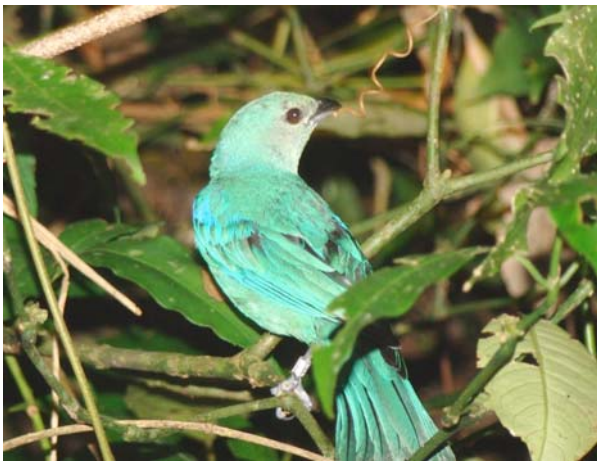
Figure 2. Thraupis cyanoptera is an endemic species of Atlantic forest occurring at Ilha Grande, state of Rio de Janeiro, Brazil.

A total of 175 bird species were encountered at Ilha Grande during the primary surveys. An additional 47 species were obtained from secondary data from other authors (Maciel et al. 1984; Maciel and Pacheco 1995; Coelho et al. 1991; Pacheco et al. 1997; Buzzetti 2000; Raposo et al. unpublished data; Maciel unpublished data), including data from other locations at Ilha Grande besides the ones we sampled (Table 1). This represents 222 bird species from 58 families.