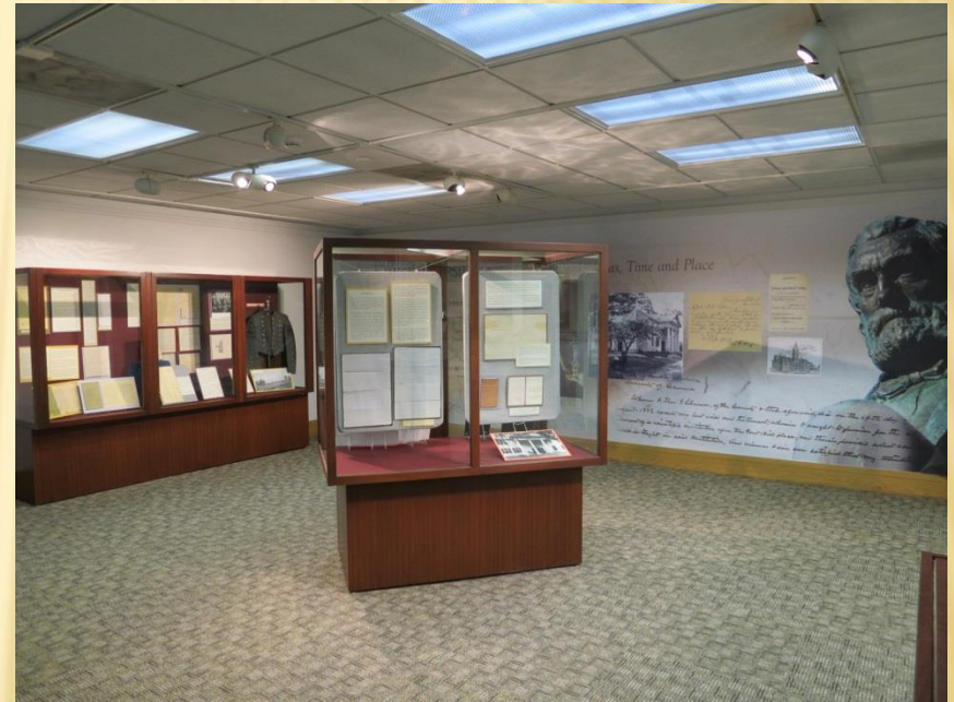
The Founding of Clemson University: A Confluence of People, Ideas, Time and Place (currently on display)