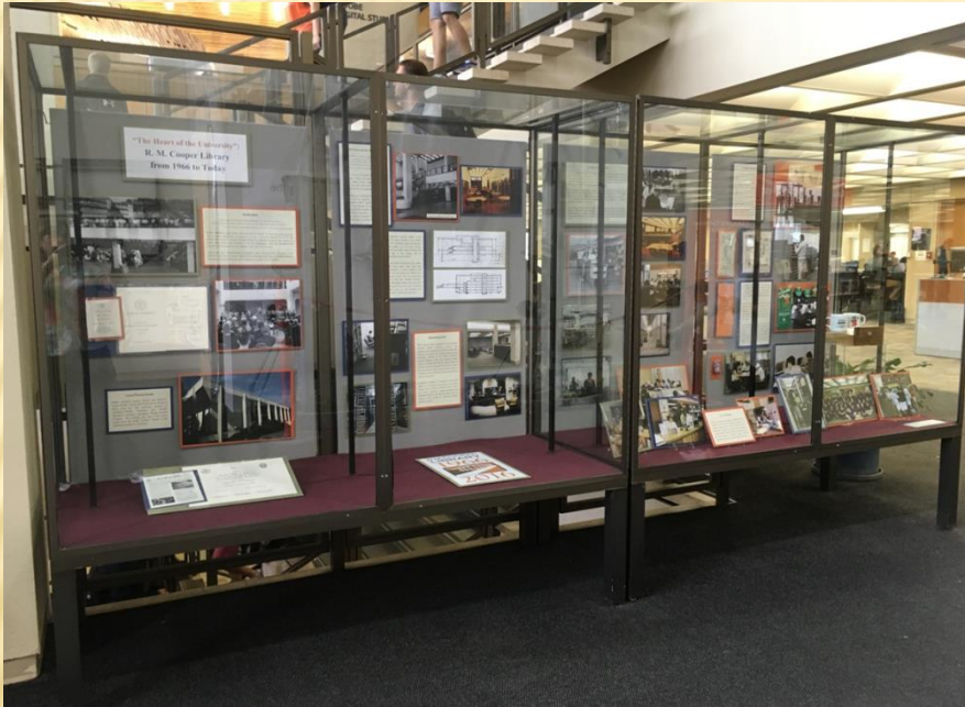
"The Heart of the University": R. M. Cooper Library, 1966 to Today (currently on display)

Display areas also include Gunning Architecture Library in Lee Hall