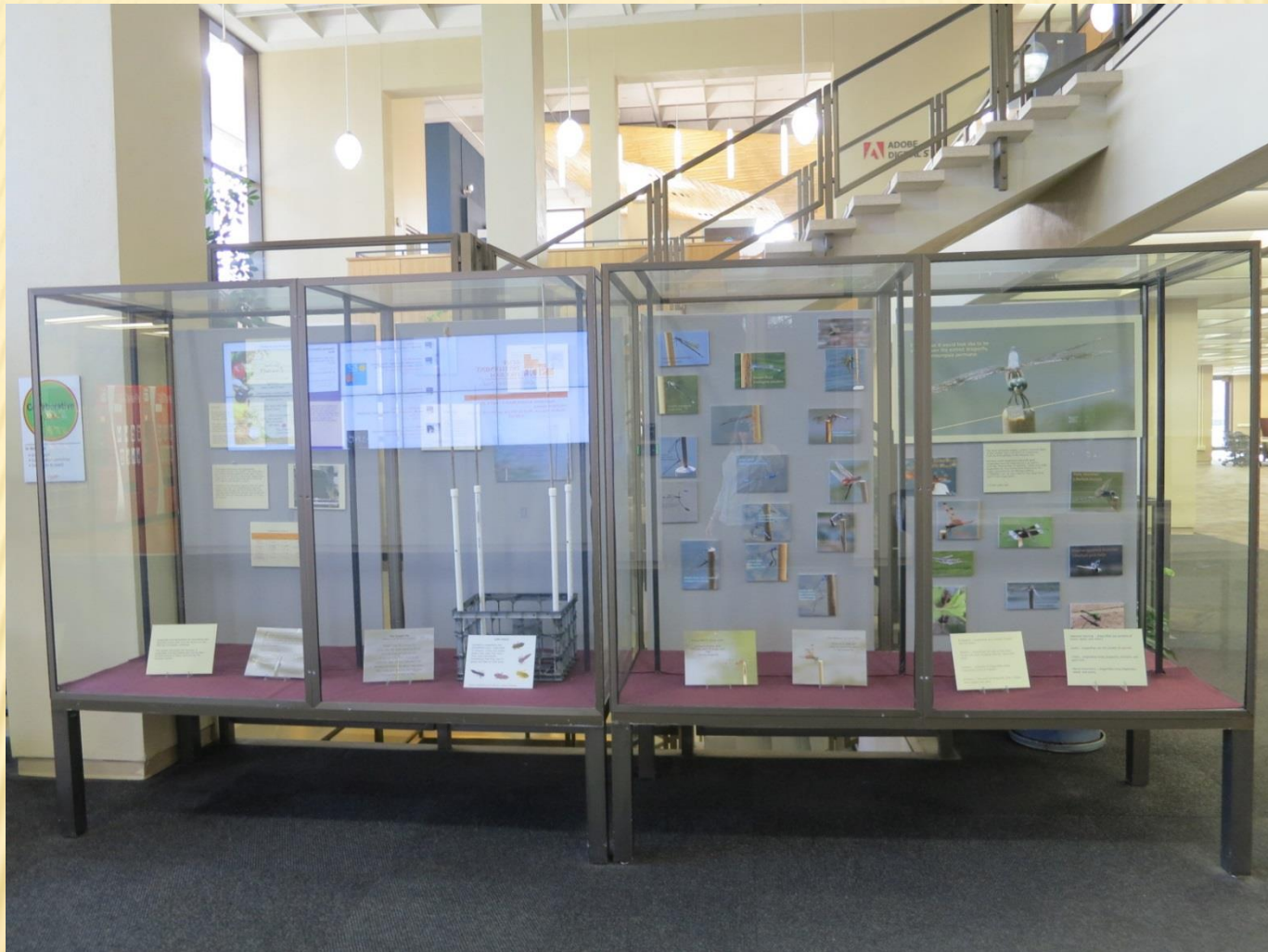
Dragonflies and Damselflies in Cooper Library Pond (summer 2016) - created in conjunction with a professor based on findings from a summer internship project conducted by three of his students