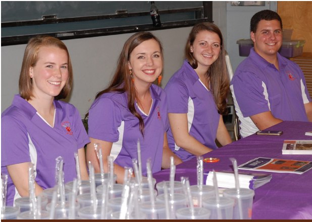
AVS Ambassadors at a Destination Clemson event