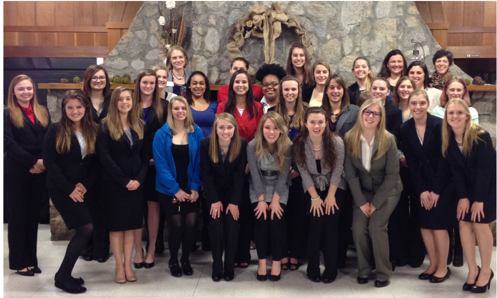
The WAVS girls posing at the professional dress dinner