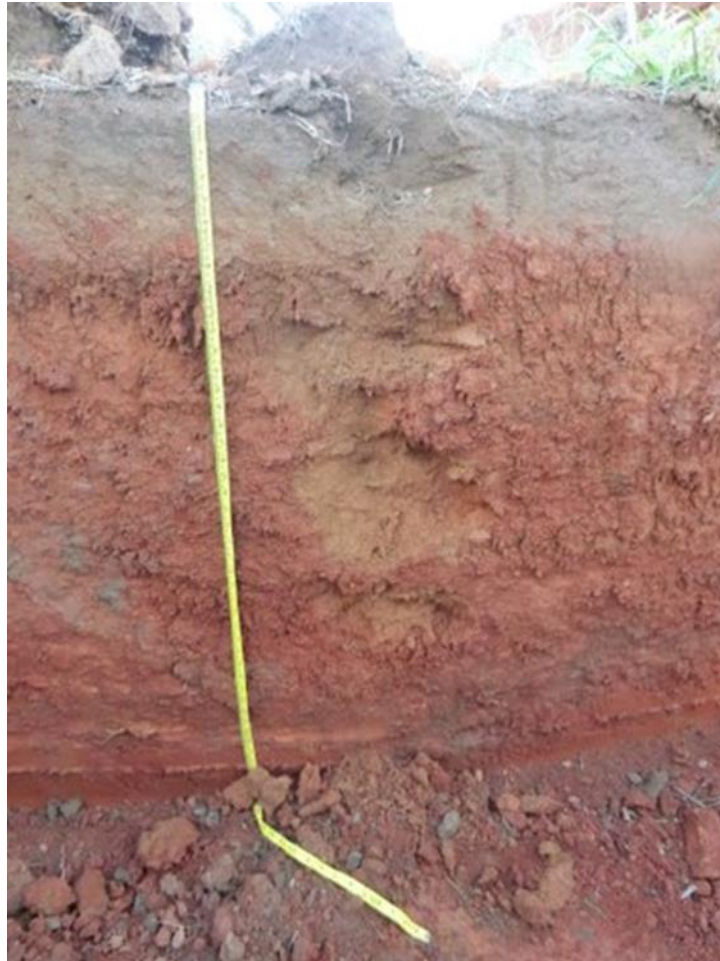
Fig. 1. Example of soil profile (out of 7 total soil profiles used in the study) for practice Soil pit 2 during 2014 Southeast Regional Collegiate Soils Contest (October 5-9, 2014)