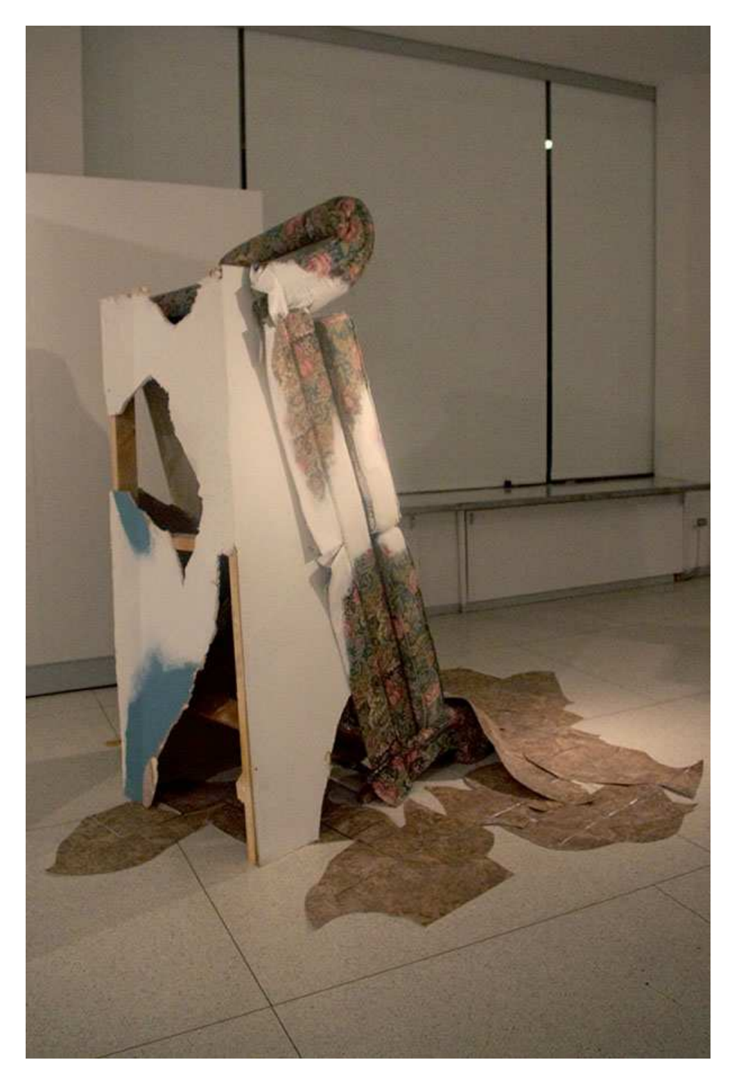
3.2 Nature 3 (Landscape Couch) Second View