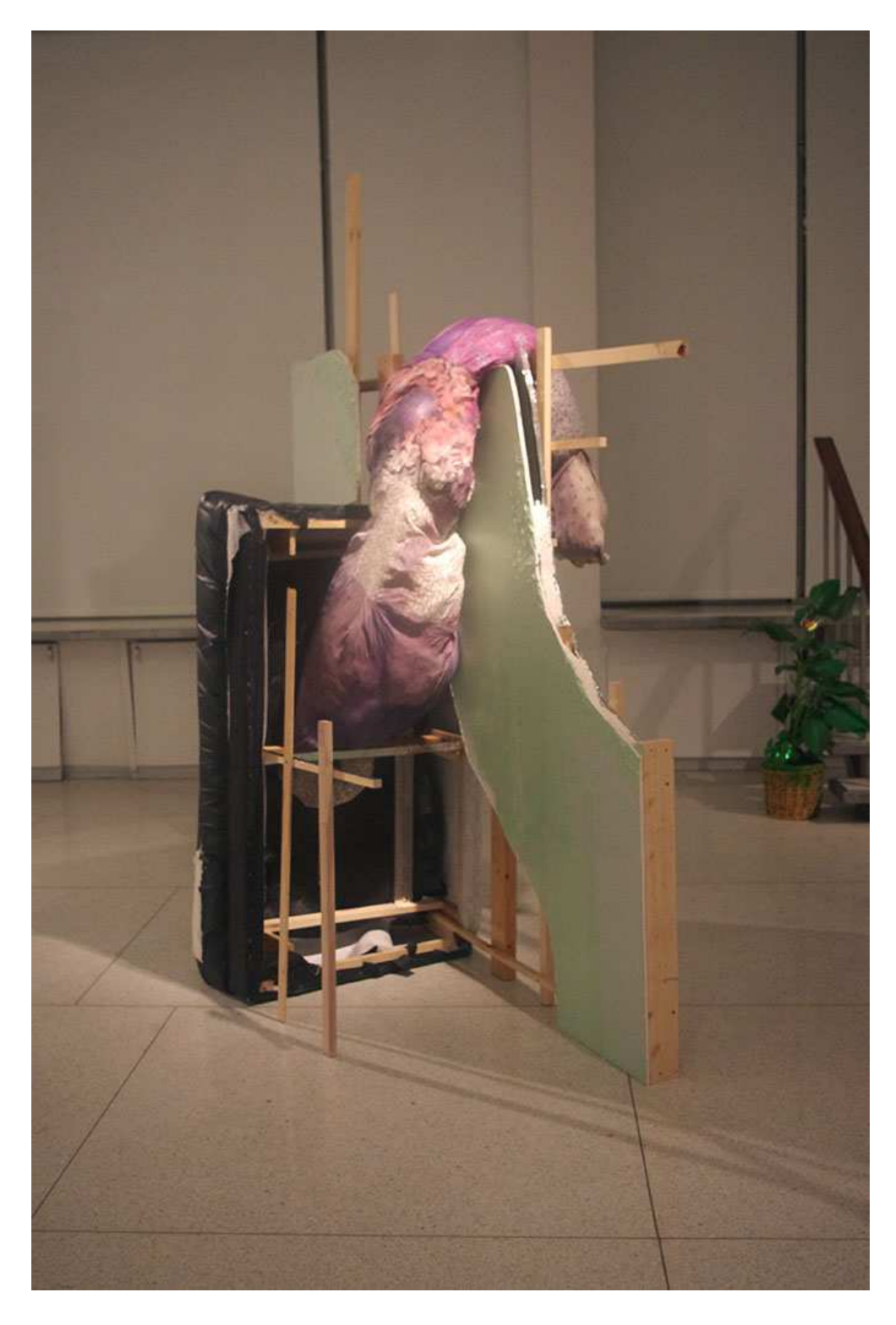
4.1 Culture 1 (Black Couch)