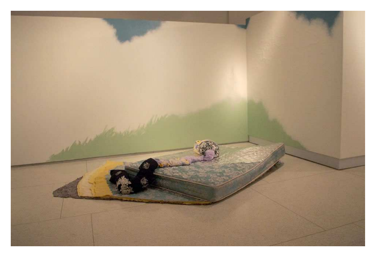
5.1 Culture 2 (Bed)