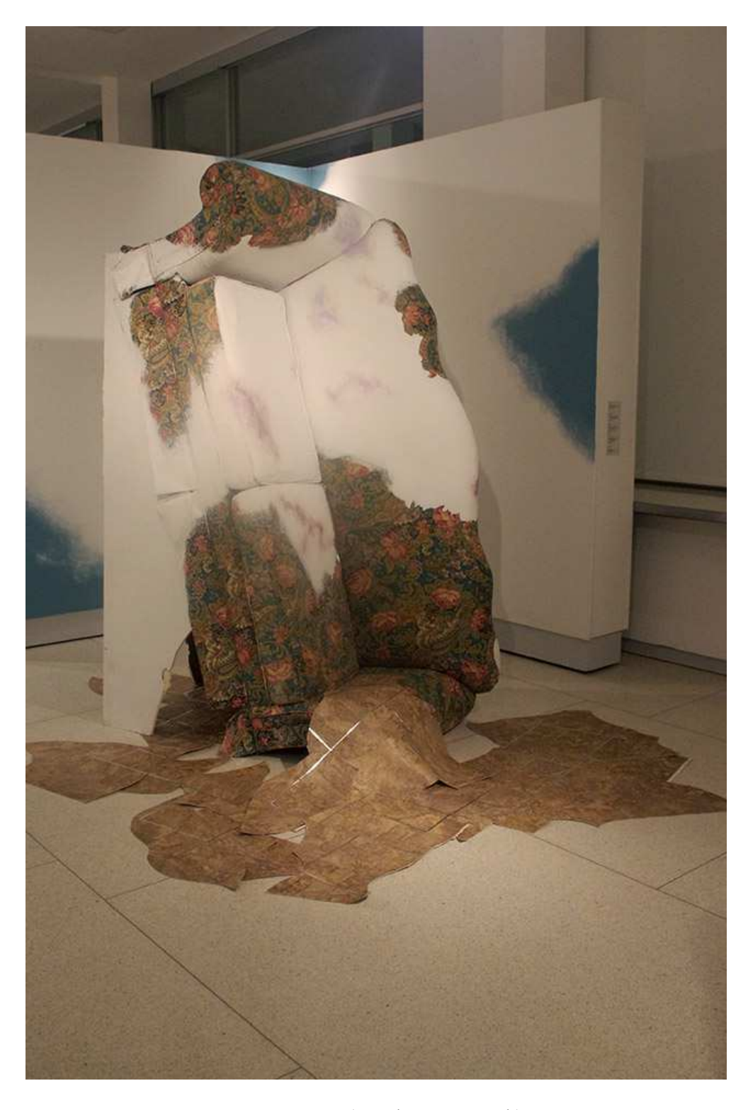
3.1 Nature 3 (Landscape Couch)