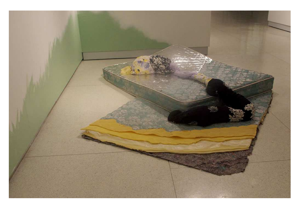
5.2 Culture 2 (Bed)