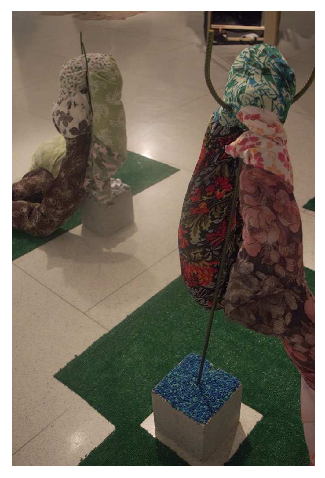
2.2 Nature 2 (Astroturf and Clothes) Detail