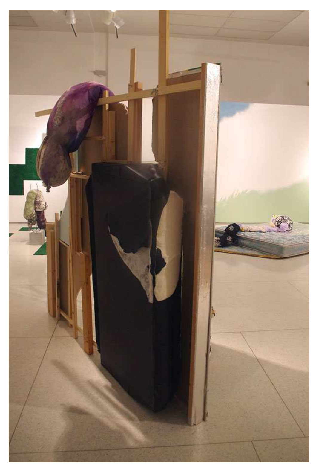
4.2 Culture 1 (Black Couch) Second View