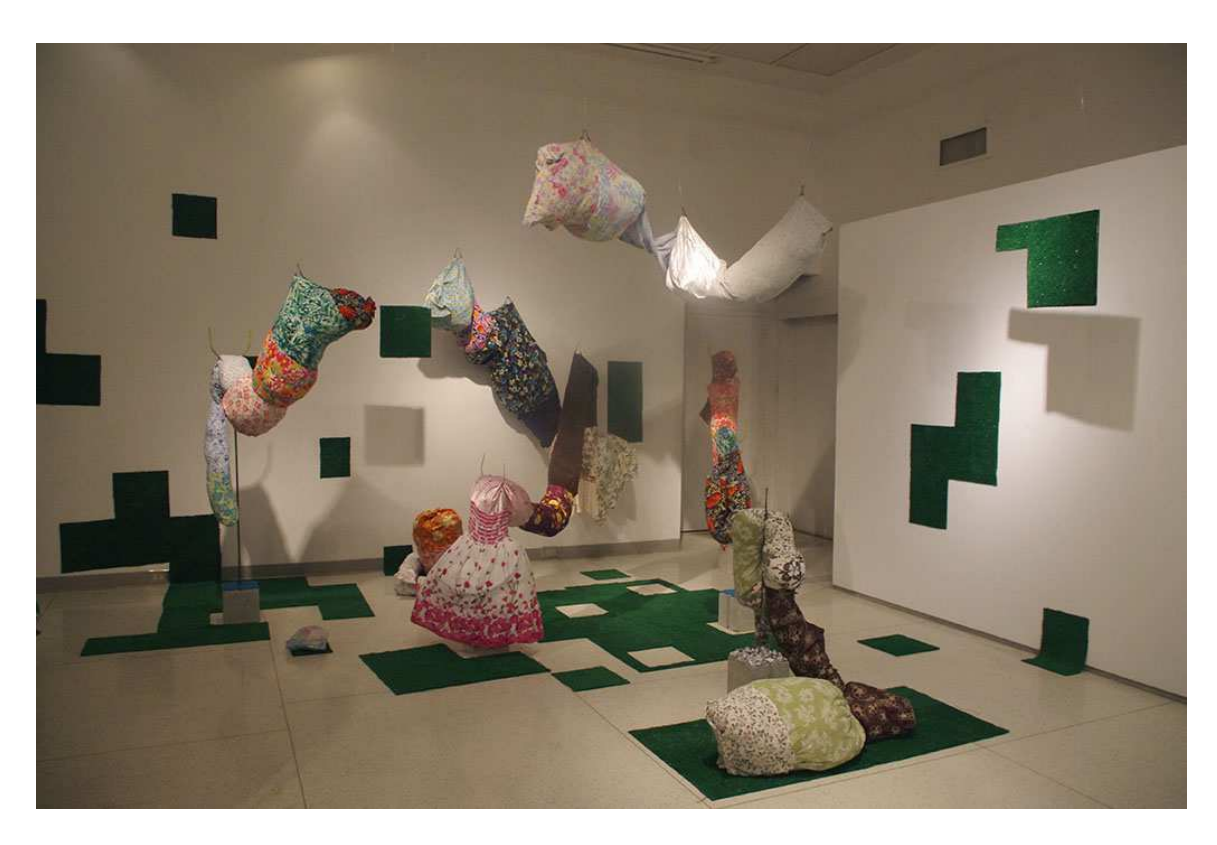
2.1 Nature 2 (Astroturf and Clothes)