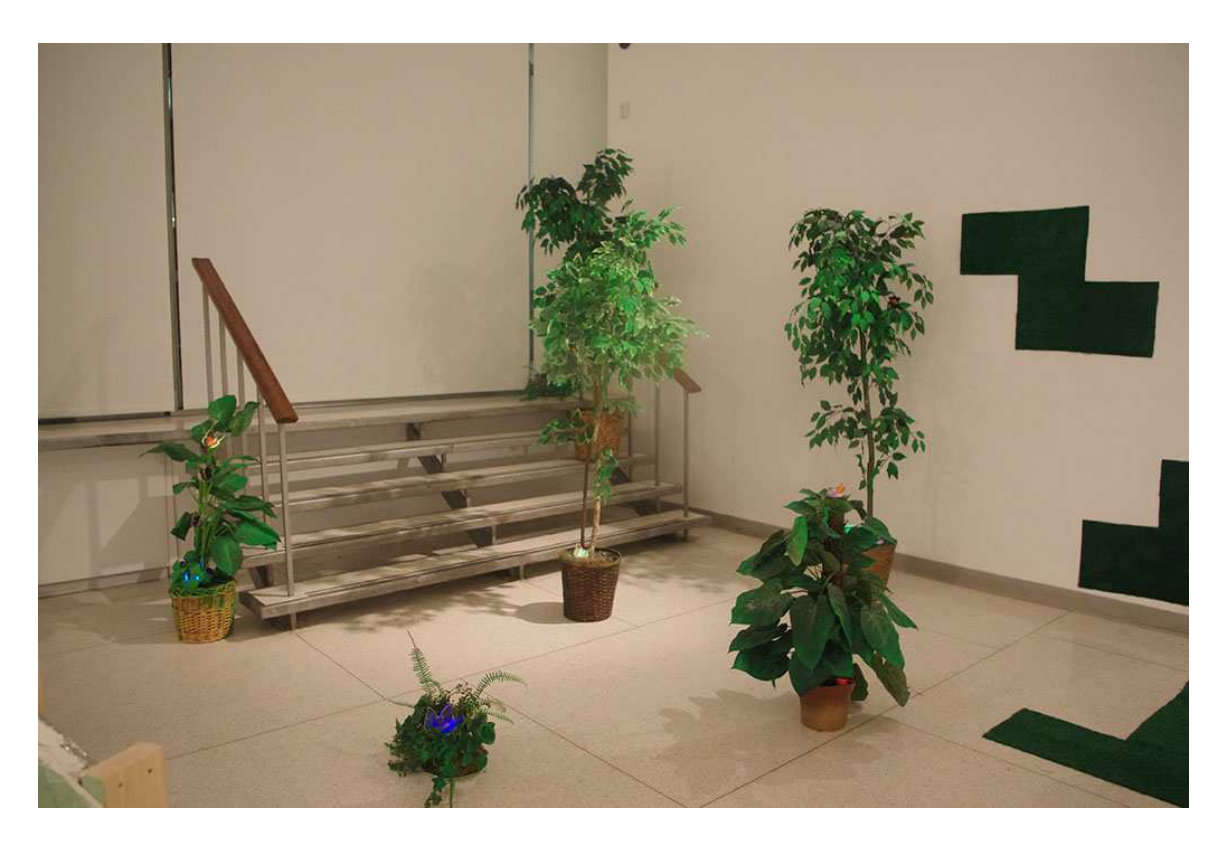
1.1 Nature 1 (Artificial Forest)