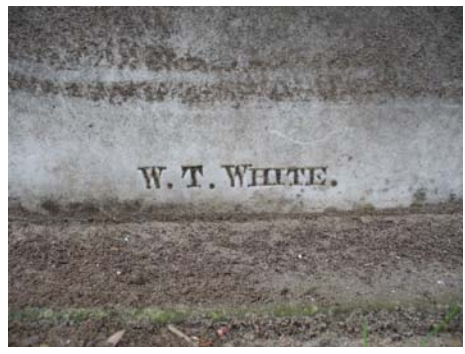
Figure 1.3 & 1.4 – An example of two headstones at Second Presbyterian Church's graveyard carved by W.T. White.