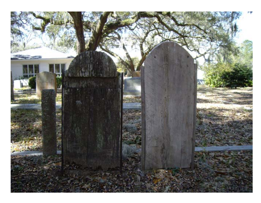
Figure 1.2 – Example of wooden headboards at St. James' Church. West Ashley, South Carolina

headboards, and footboards. Because they are easily subject to decay, there are few wooden grave markers left in Charleston.<sup>11</sup>