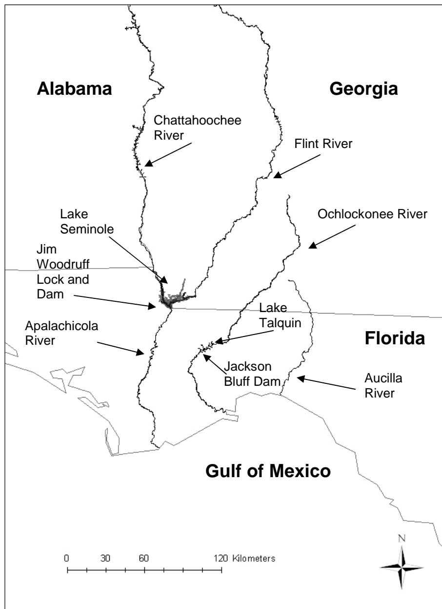
Figure 1. The study area consisting of the Apalachicola River, Florida, below Jim Woodruff Lock and Dam and the lower Ochlockonee River, Florida, below Jackson Bluff Dam.