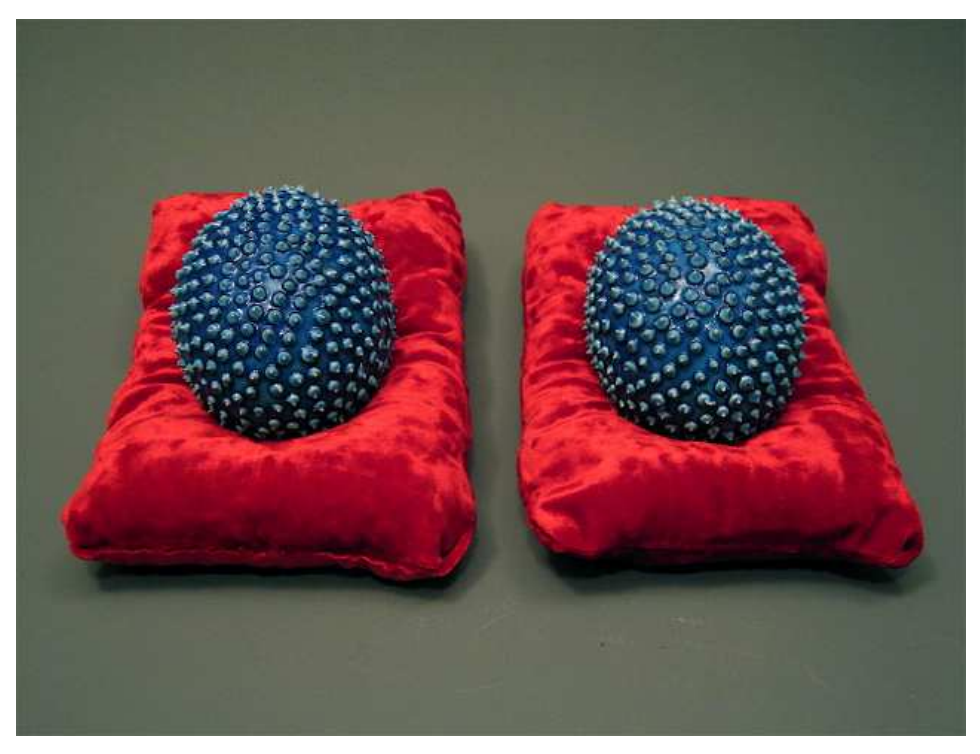
"If Hands Could Talk"