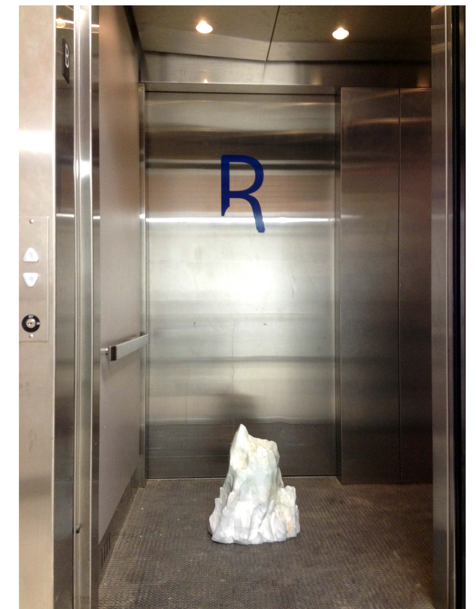
Semi-Permanent Form I, Various Installations, 2015.