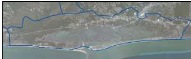
Figure 1 – USGS 12-digit HUC

The currently accepted primary delineation is the U.S. Geological Survey (USGS) 12-digit Hydrologic Unit Code (HUC), named Main Creek, for Murrells Inlet which has the classification number 030402080308 (Seaber et al. 2007). This HUC consists of approximately 10,049 acres and is seen in Figure 1.