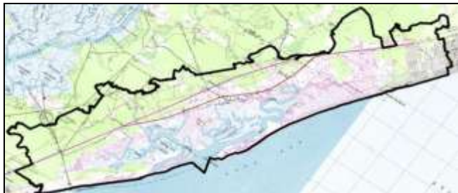
Figure 2 – Overall Murrells Inlet watershed

With the requisite input data layers processed, a base watershed layer was created using the watershed tool. The default watershed size was initially set to a mean of 10 acres so that substantially smaller neighborhood-sized subwatersheds could be delineated and then assessed relative to county stormwater infrastructure data. These watersheds ranged in size from 57 acres, the largest, to a less than 1 acre sized subwatershed. The watershed tool processed total areas flowing to a given outlet or pour point, typically the lowest points within the mean 10 acre area. Often these areas would terminate at locations where stormwater infrastructure information indicated an existing structure or conveyance.