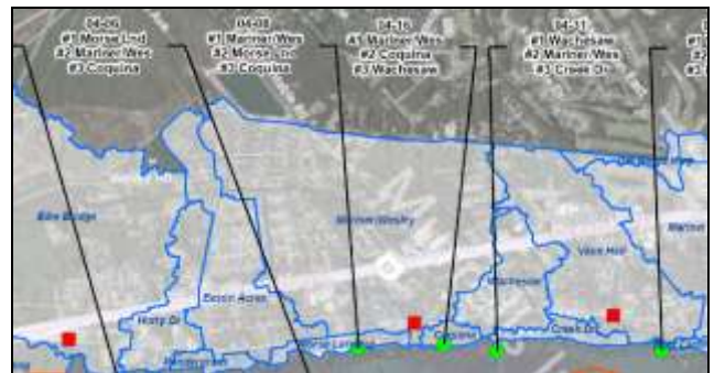
Figure 4 – Subwatersheds with prioritization

These larger final subwatersheds were important because the steering committee designated the SCDHEC monitoring stations with priority levels by tier. For example, Tier One sites were those that have not met the 90th Percentile nor Geometric Mean standard for the entire assessment period of the long term trend analysis.