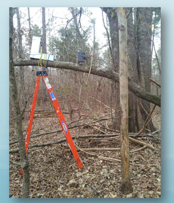
Figure 4. Rural Site