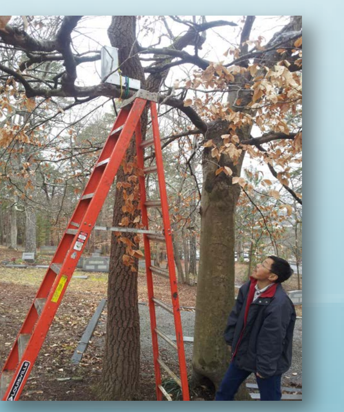
Figure 5. Urban Site (Low Foot Traffic)