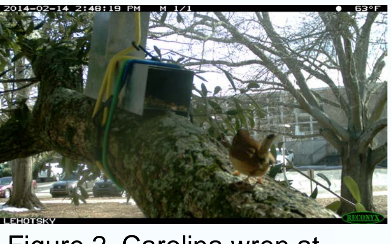
Figure 2. Carolina wren at hopper (urban site with high foot traffic)