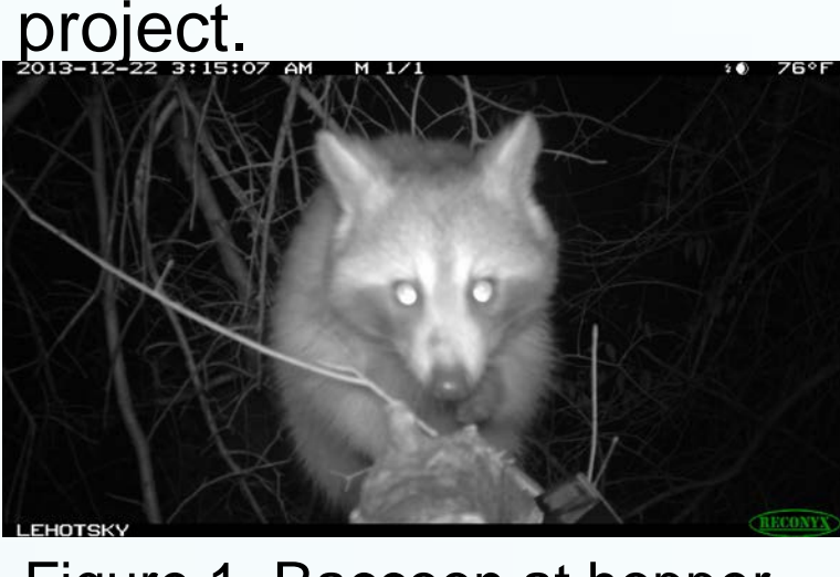
Figure 1. Raccoon at hopper (rural site)

During the current study on Clemson University's campus, there has been a variety of non-target species usage, from songbirds to small mammals, which has resulted in questions regarding possible actions that can be taken to lower nontarget usage. As expected, many of the suggestions for limiting non-target usage include traditional means such as exclusion techniques, repellents, scare tactics, and bait changes. However, none of these methods were directly tested during the