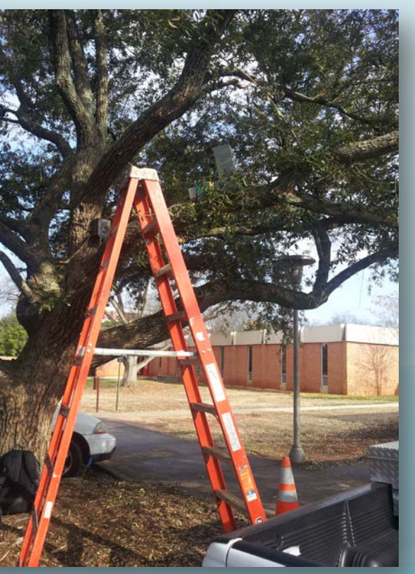
Figure 6. Urban Site (High Foot Traffic)