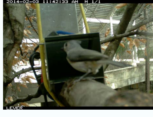
Figure 3. Tufted titmouse at hopper (urban site with low foot traffic)