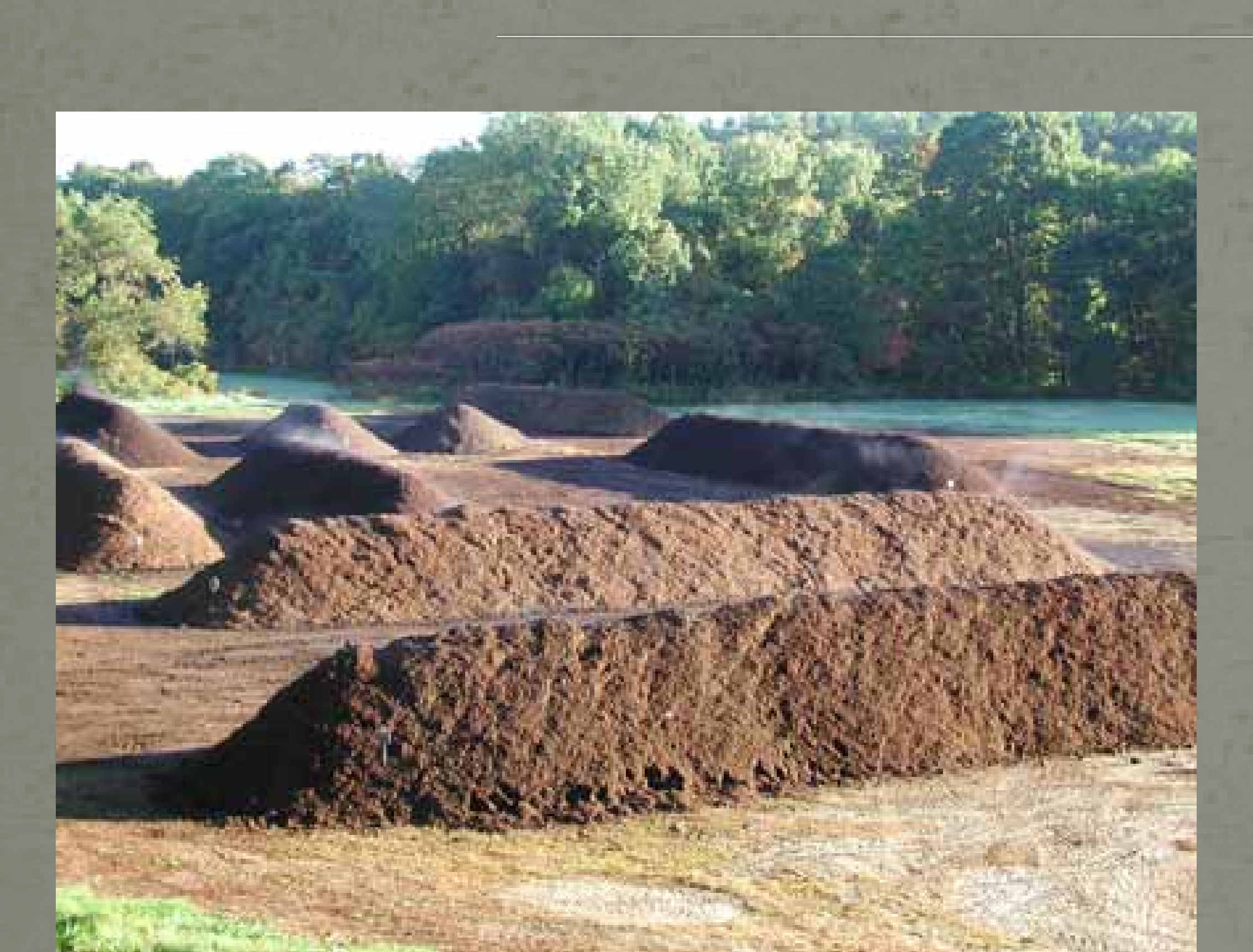
(An example of windrow composting)

One of the main issues is the prevalence of plastic waste and the lack of facilities to process it.