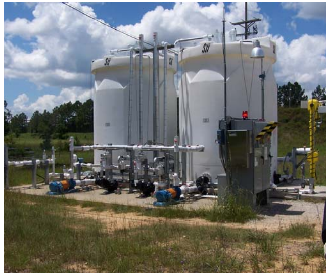
Figure 2. Humate addition system.

The system consists of two double-walled 5,500 gallon (21 m 3 ) storage tanks, each with a level transmitter, annular-space leak detection system, and recirculation pump to keep the potassium humate in suspension (Figure 2). A small flow of domestic water acts as a carrier solution to prevent settling of the potassium humate