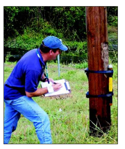
Figure 2. Water-level sensor device attached to power pole.

Following the passage of the storm, the sensors are recovered and the data are downloaded and processed. Water-level data are corrected for changes in barometric pressure using data from a co-located or nearby barometric-pressure sensor. Water-level data also may be corrected for salinity. Corrections for salinity are based upon the location of the sensor in proximity to the coast, as either saltwater (density of 64.0 lbs/ft<sup>3</sup> [pounds per cubic foot]), brackish water (density of 63.1 lbs/ft<sup>3</sup>), or freshwater (density of 62.4 lbs/ft<sup>3</sup>) (McGee and others, 2006). Vertical distances to the water surface and to available high-water marks are measured relative to the temporary elevation benchmarks to confirm water-level sensor accuracy. Traditional line-of-sight leveling is