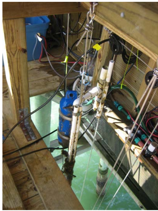
Figure 2. Pier monitoring station at the Second Avenue Pier showing ziplines and counterweighting. (a) Left photograph shows the surface sonde strapped to a PVC “sled” that slides vertically on the ziplines. The blue buoy is flotation that maintains the surface sonde’s position about 1 m below the sea surface. (b) Right-hand photograph shows the zipline and PVC sled. The blue box in the upper left corner houses the RAD-7 detector. Red hoses in the lower right-hand corner are part of a filter manifold that prevents particles from clogging the Rn detector.