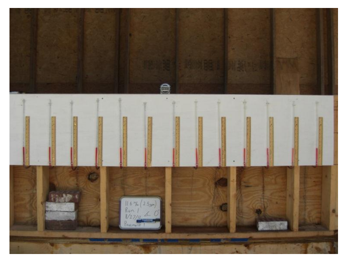
Figure 2: Image of calibration testing. Red food coloring has been used to enhance the resolution of the water level inside manometer tubes. Photos were taken at 30 second intervals to determine the change in depth of water within the aggregate layer over time.

A series of tests were run in which a fixed volume flow rate of water was evenly released across the width of the pavement at the upstream end. The distance from the release point to the point where the flow had fully infiltrated was measured for pavement slopes equal to 0%, 5%, and 10%. Flow across the pervious pavement was non-uniform; therefore, the maximum and minimum flow lengths were recorded. The measured flow lengths were then plotted and compared with the lengths required for