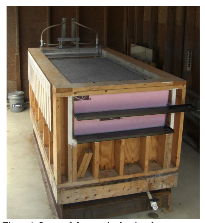
Figure 1: Image of the test rig showing the pavement, weir, manometers for measuring subsurface flow, and the collection trays at the downstream end.

Water is allowed to flow laterally out of the downstream end of the box. At the downstream end there are a pair of metal trays which collect water flowing from the pavement and aggregate layers respectively. The rig is equipped with three variable area flow meters to regulate the amount of water placed on the pavement surface. A soaker hose is used to simulate rainfall and a weir is used that creates sheet flow to simulate run-on. A panel of manometer tubes is situated along the length of the box