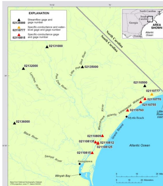
Figure 1. Study area including the Pee Dee and Waccamaw River Basins and Atlantic Intracoastal Waterway in South Carolina.

To simulate the effects of sea-level rise, the mean coastal water levels were incremented by 0.5-foot (ft) to simulate sea-level rises of up to 3 ft. To simulate the effect of reduced streamflow to the coast, the daily historical streamflows were reduced by increments of 5 percent to simulate reduction of up to 25 percent. Daily