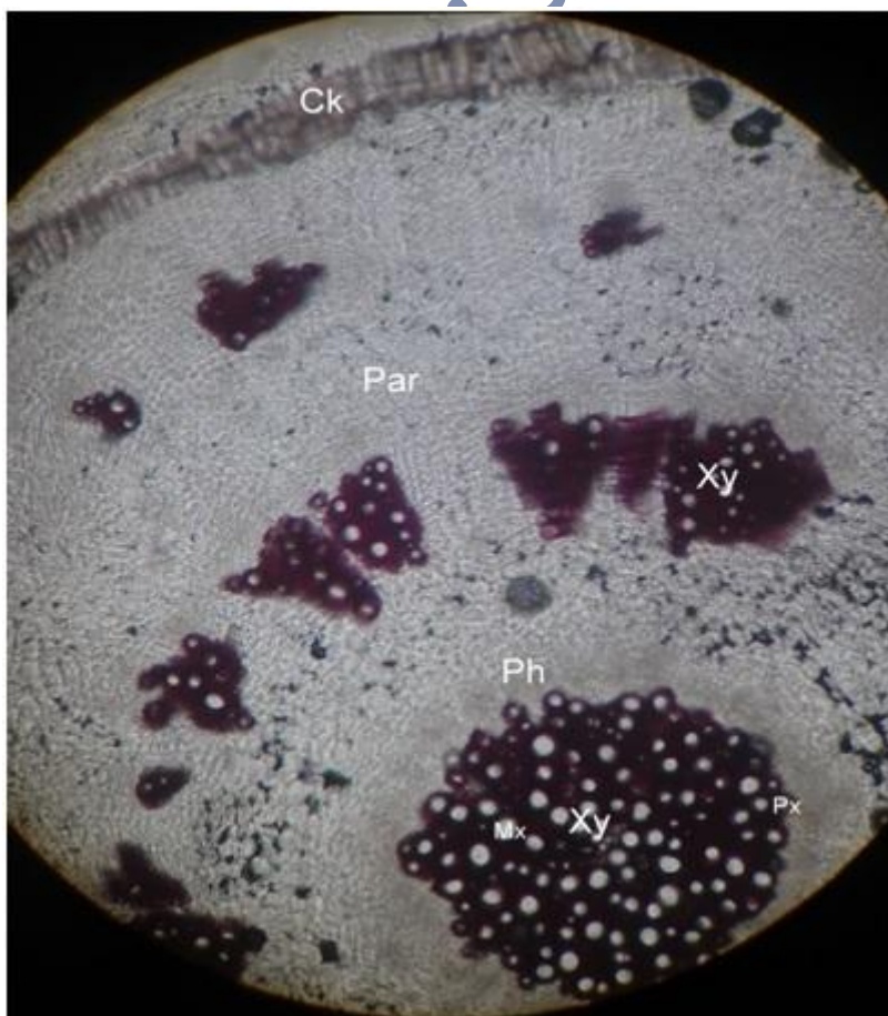
Figure 2: Transverse section of the root of Gomphrena serrata . Ck: Cork; Par: Parenchyma; Xy: Xylem; Ph: Phloem; Px: Proto Xylem and Mx: Meta Xylem.

The transverse section of the root of G. serrata showed the presence of Cortex was made up of thin walled parenchymatous cells with very small intercellular spaces. The endodermis showed the presence of phloem and xylem. The phloem is present in between the medullary rays. The medullary rays are parenchymatous and are uniseriate to triseriate, majorly biseriate. Phloem is well developed and shows the presence of phloem fibers, which are lignified. It also showed the presence of phloem parenchyma. The xylem region was similar to phloem region and was also surrounded by uniseriate to triseriate. Xylem tissue consists of spiral xylem vessels, xylem fibers and xylem parenchyma (Figure 2).