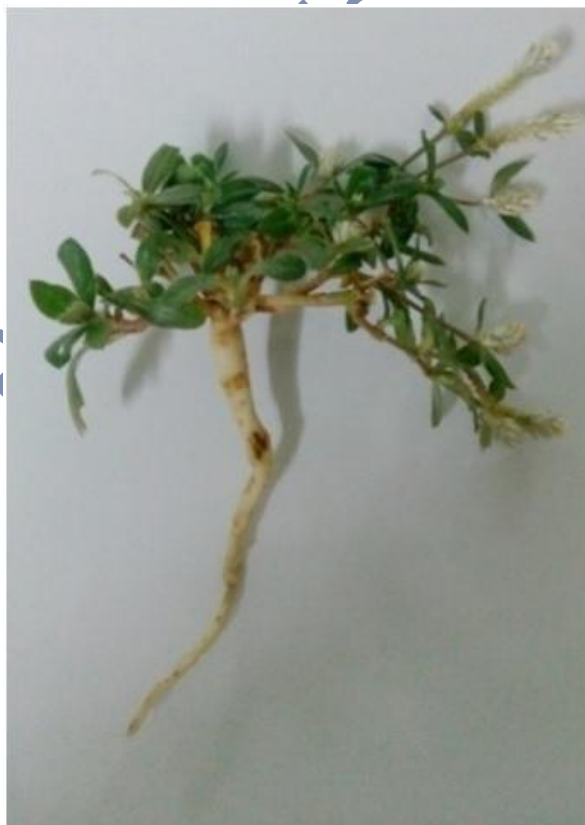
Figure 1: Organoleptic characteristics of the whole Plant of Gomphrena serrata

The morphological characteristics of G. serrata root were described in Figure 1 and Table 1.