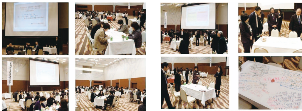
World Café talk sessions (at Morioka Grand Hotel, on Nov.2010)

Finally, participants took a gallery tour of the “Post it” wall and shared collective knowledge visible and actionable.