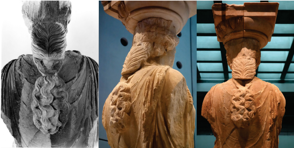
Image 16: Kore D. Black and white photo. © 1970, Courtesy of Deutsches Archäologisches Institut-Athens, (inv. neg. no. 70/447, photo, Goesta Hellner. Colour photos © 2014. The Acropolis Museum. Photo by K.A. Schwab

for Kore F. The model's thick and slightly wavy hair shows the difference between the braided section and the wavy loose locks of hair below the band.