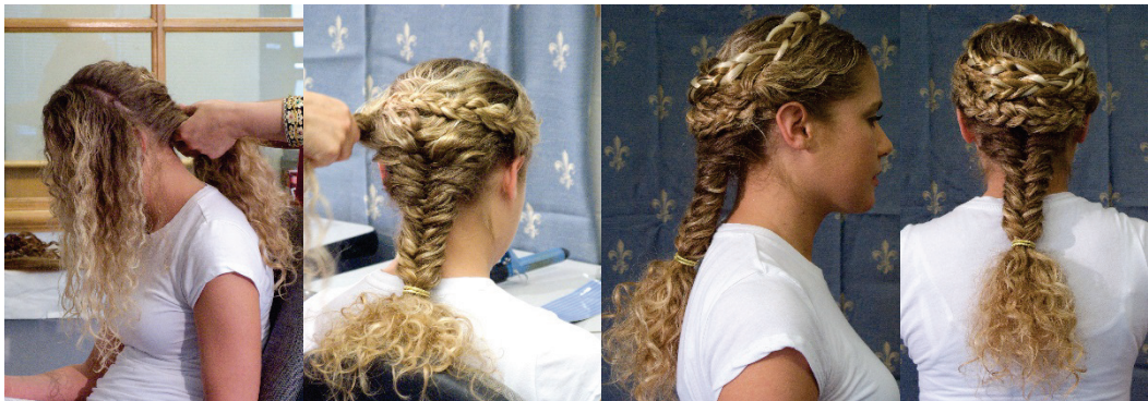
Image 13: Kore B, Fairfield University model D. Westrup, hair styled by M. Torres.