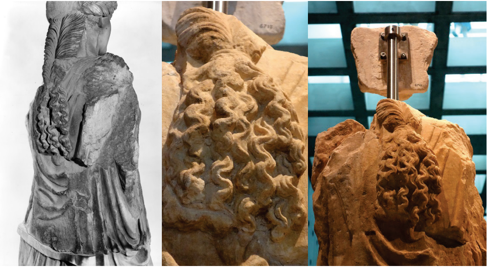
Image 20: Kore F. Black and white photo. © 1970. Courtesy of Deutsches Archäologisches Institut-Athens, inv. neg. no. 70/458, photo, Goesta Hellner. Colour photos © 2014. The Acropolis Museum. Photo by K.A. Schwab

pattern followed by a tighter braiding sequence directly above the band. Curly locks of hair below the band successfully convey the texture on the original sculpture.