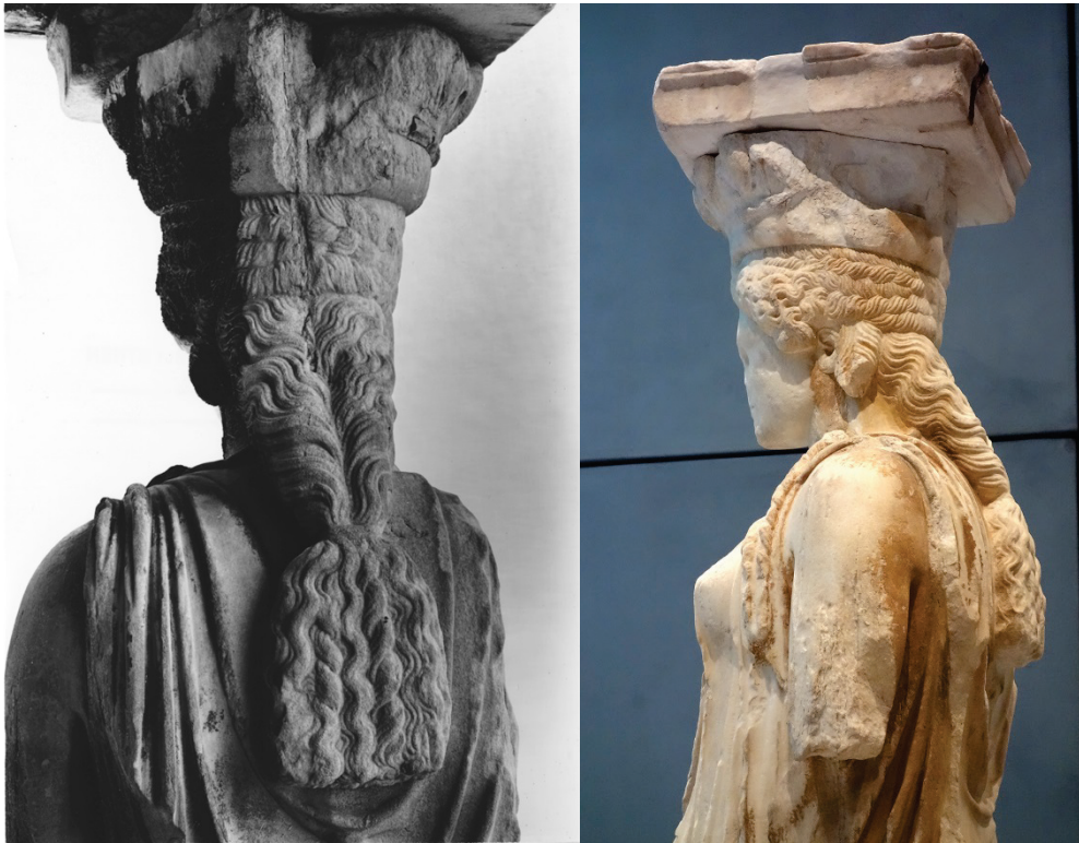
Image 12: Kore B. Black and white photo © 1970. Courtesy of Deutsches Archäologisches Institut-Athens, inv. neg. no. 70/443, photo, Goesta Hellner. Colour photo © 2014. The Acropolis Museum. Photographed by K.A. Schwab