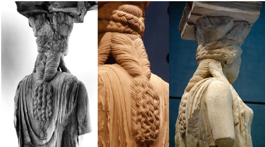
Image 18: Kore E. © 1970. Black and white image. Courtesy of Deutsches Archäologisches Institut-Athens, inv. neg. no. 70/451, photo, Goesta Hellner. Colour photos © 2014, The Acropolis Museum. Photo by K.A. Schwab

early steps in the main braid leading to the completed braid, which is quite thick. Additional hair was added below the band to create the specific texture of the original.