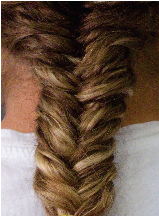
Image 6: Detail of fishtail braid worn by student model for Kore B.

Most of us are familiar with the English braid, which is made with three ‘legs’ (Image 5, centre). A variation on the English braid can be made with four ‘legs’ (Image 5, right). It is easy to make but looks quite complicated. In contrast, the Caryatids wear the fishtail braid, which is made with two ‘legs’ of hair (Image 5, left). Different looks are generated depending on the tension maintained during braiding and the size of the section of hair pulled around to the other side (Image 6). Smaller sections create a tightly woven look (as in Image 5, left), but larger sections can create the looser more textured appearance found in the original statues.