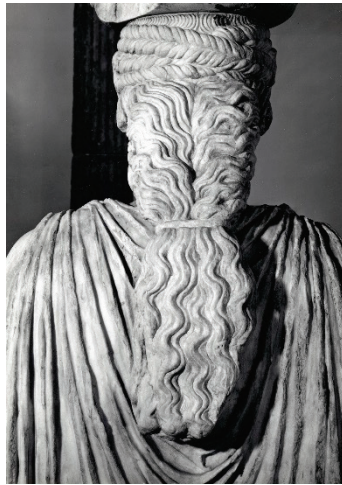
Image 14: Kore C, Black and white image.

because it was among the sculptures removed from the Acropolis by Lord Elgin and transported to London at the beginning of the nineteenth century. The marble surface has less weathering than the other five Caryatids, and it clearly preserves a short braid pulled back at the hairline above the forehead. This special braid would later be cut as a dedication before marriage, alluding to the maiden's status. In recreating this short braid, additional hair was intertwined with the model's hair to achieve the same effect. Of the six Caryatids, Kore C appears to have the most textured hair, and this is matched to the model's hair.