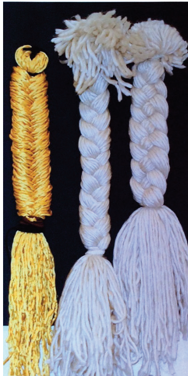
Image 5: Samples of braids. Left: Fishtail braid made with two ‘legs.’ Middle: English braid made with three ‘legs.’ Right: Four-legged braid.

The styling session required approximately seven hours, one student at a time, and it was filmed for a subsequent video. The student for Kore B had the easiest hair to style, and it came together faster than the others, in only forty minutes. The other hairstyles averaged about one hour, with a few taking as much as one hour and twenty minutes. Ms Torres used hair spray and a curling iron on the slightly wavy hair, otherwise, a few bands and pins held the final version in place. In a few cases she incorporated artificial hair to complete the full set of braids or to add length: braided to wrap around the heads of Kore A and B, woven into the hairline of Kore C to match a fishtail braid visible at the front of the statue, and to complete the lower unbound hair of Kore E. Final photographs were taken outside during a heat wave on 26 April 2009 when the temperature reached 33°C. Students stood in the same formation as the original statues, with the correct spacing between each figure. The heat caused the very textured hair to curl more and to shorten, whereas the heavier straighter hair could not hold its curl during final photographs. While the heat produced some unforeseen problems, it also captured a sense of summertime in Athens when the heat can be quite strong. All the student models noted that the hairstyle was unexpectedly cool and comfortable.