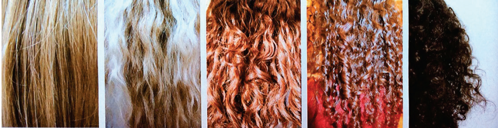
Image 8: Hair samples from pin straight at left to coiled curls at right.

Examples of hair, from pin straight to strongly textured, reflect the nature of the shape of the cortex as well as the follicle itself. Pin straight hair tends to be stronger and shiny from the natural oils that easily travel the length of the hair shaft. Highly textured hair, with its many twists and turns, is more difficult to keep moisturized, and its tendency toward dryness makes it delicate (Image 8).