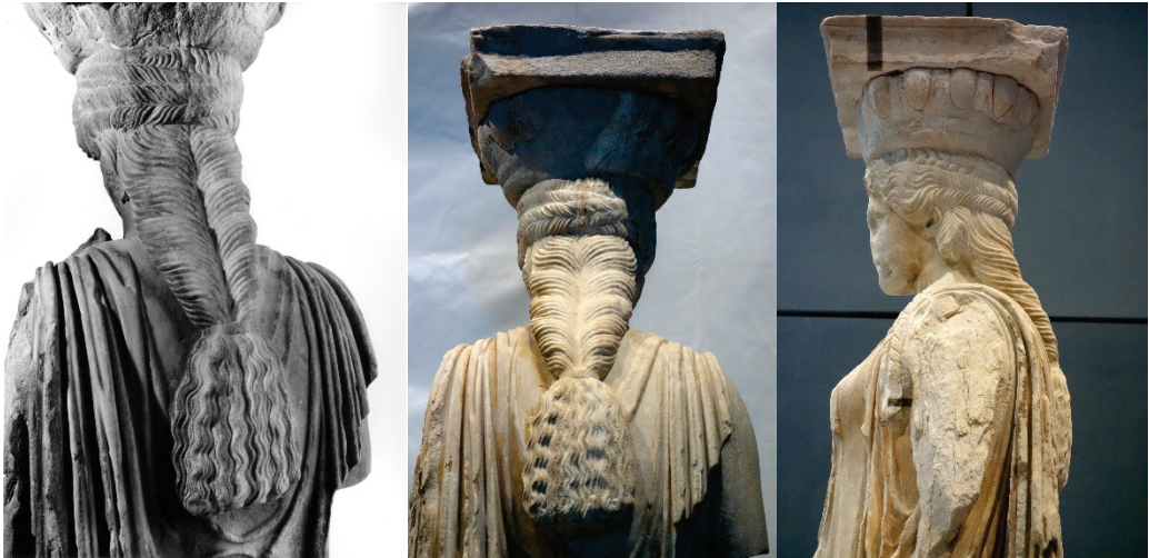
Image 10: Kore A. Black and white photo ©1970. Courtesy of Deutsches Archäologisches Institut-Athens, inv. neg. no. 70/437, photo, Goesta Hellner. Colour photos © 2014. The Acropolis Museum. Photos by K.A. Schwab

the shoulders, adding to the richness of the hairstyle in combination with the back-pinned mantle and belted peplos.