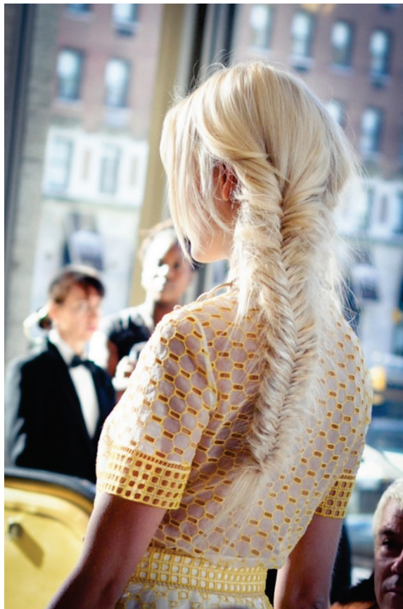
Image 4: Detail of model wearing fishtail for Tory Burch, New York Fashion Week, Spring 2013.