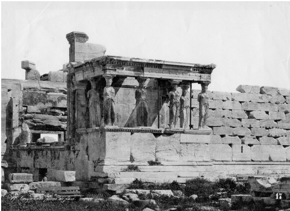
Image 1: Late nineteenth century photograph of the Erechtheion. No copyright – public domain

the north porch which is visible from many distant areas within the modern city of Athens, and the south porch famous for its beautiful female figures serving as columns. The six maidens or kore figures, commonly known as Caryatids, face directly toward the Parthenon's north flank (Image 1).