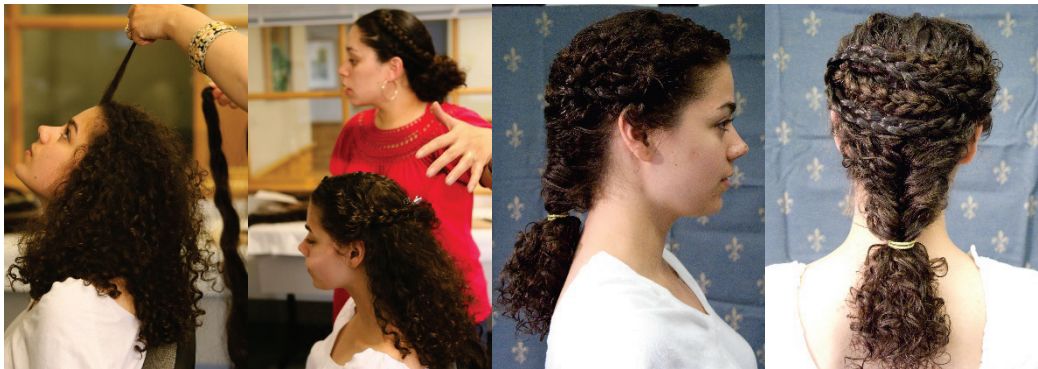
Image 15: Kore C, Fairfield University model A. Nowak, hair styled by M. Torres.