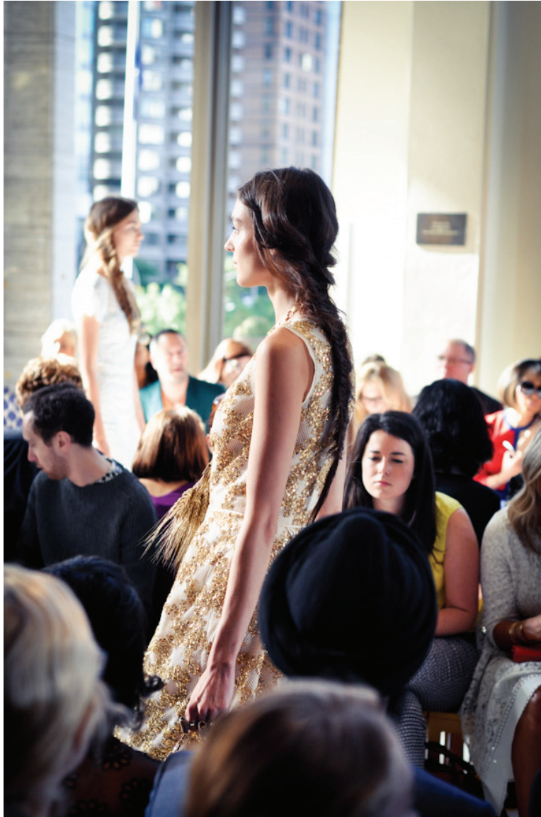
Image 3: Models for Tory Burch, New York Fashion Week, Spring 2013.

In recent years in the United States, the fishtail braid became high fashion in New York and Hollywood, as part of a larger trend of braided hairstyles worn by young girls, teenagers of similar ages to the late-teenage Greek maidens on the Erechtheion, and adult women. 16 Although braiding has long been a feature of adult African-American male and female hairstyles in the United States, with salons dedicated to them becoming especially popular among African Americans in the early 1990s, it was rarely acknowledged by mainstream media or worn by fashion models, who are predominantly white. 17 The fashion press reported that Spring 2009 was the season when different