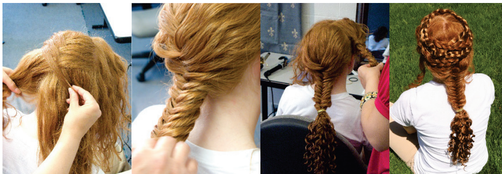
Image 19: Kore E, Fairfield University model C. Parker, hair styled by M. Torres.