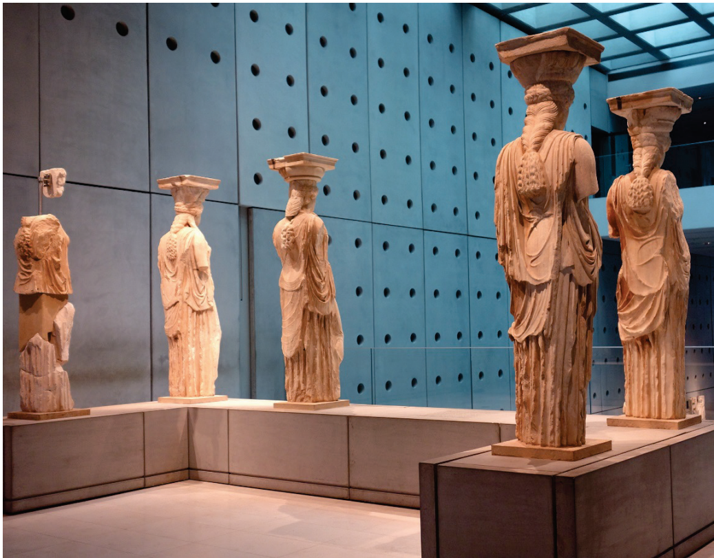
Image 2: View of the Five Caryatids from the Erechtheion in the Acropolis Museum.

account how clothing had the ability to show its wearer's inclusion and exclusion from social categories, it is likely that these braids reflect real hairstyles that were a mark of distinction belonging to a specific group – in this case, possibly kanephoroi . Kanephoroi were groups of virgins selected to perform the very important task in a religious festival of leading the ritual procession to the sacrifice. They were privileged girls – daughters of aristocrats, faultless in reputation, representatives of the highest echelon of Athenian society. The Classical Art Historian Linda Roccas identified the Caryatids as possible kanephoroi by their distinctive festival garment, the back-mantle pinned at the shoulders. 4 Should this identification as kanephoroi be correct, the very elaborately arranged braids would be a component of their festival costume, in addition to their mantles. This identification aligns with the accentuation of the Athenian aristocracy the Classical Art Historian Jenifer Neils discusses on the Parthenon frieze. 5