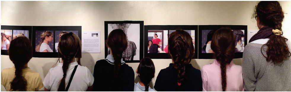
Image 23: Students wearing fishtail braids inspired by the exhibition, the Caryatid Hairstyling Project , at the Greek Consulate General in New York City.