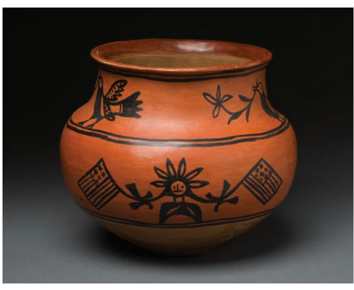
WWI Armistice Commemorative Koshare Pictorial Jar, ca. 1918, 9 x 11 ¼ inches