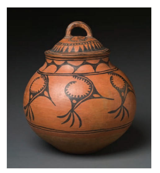
Historic Black and Red Lidded Jar , 19th century, Collected in 1880, 13 x 12 inches

Tesuque Pueblo is located just 10 miles north of Santa Fe and is one of the smallest and most traditional Pueblos. For generations, Tesuque potters produced beautiful black and polychrome on cream pottery. However, in the late 1880s, these artisans began mass-producing small bowls and rain god sculptures decorated in bright colors for commercial sale to the tourist market in nearby Santa Fe.