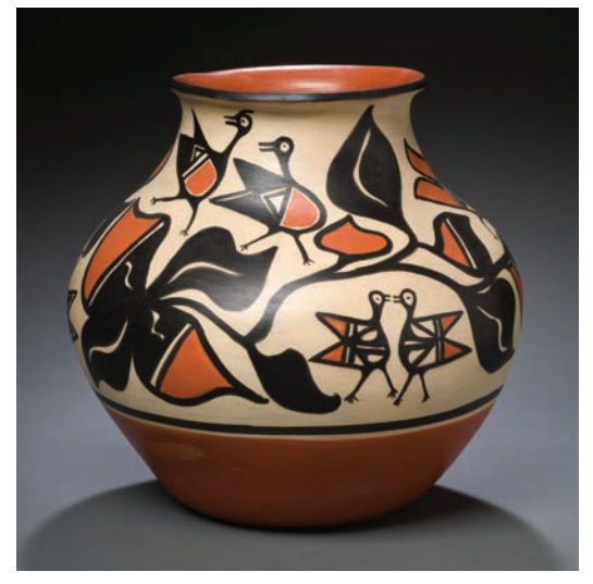
Paulita Pacheco (b. 1943), Four-Color Bird Jar, 2nd half of 20th century, 10 \frac{1}{2} \times 11 \frac{1}{2} inches

Santo Domingo, one of the largest Pueblos, is located between Santa Fe and Albuquerque, New Mexico. Santo Domingo pottery can be identified by its beige-colored clay, cream slip, and dark black geometric designs. The most striking features of such pieces are the designs themselves, which are created with large swaths of black and ample negative space. The bold geometric patterns of Santo Domingo stand in contrast to the intricate fine line patterns of the Acoma Pueblo.