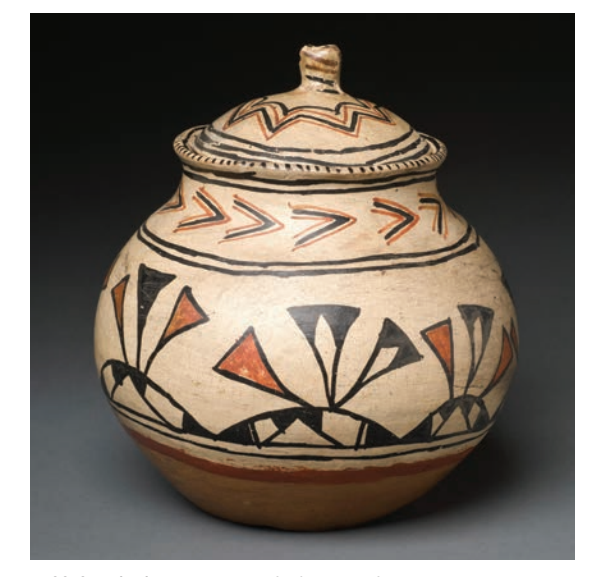
Lidded Polychrome Jar, 1st half of 20th century, 9 \ge 8 \frac{1}{2} inches

San Ildefonso Pueblo is located approximately 20 miles north of Santa Fe along the Rio Grande River, in relatively close proximity to the Bandelier National Monument. This Pueblo is renowned for the black-on-black pottery that Maria Martinez (ca. 1887-1990) and her husband Julian (1879-1943) first pioneered in 1919 (see page 7). Inspired by ancient pots, Maria and Julian experimented with reductive firing, ultimately producing beautifully polished vessels known as San Ildefonso black-on-black. Julian drew upon prehistoric designs (pre-1540 CE) when developing patterns and embellishments for Maria's vessels. Considered the matriarch of Pueblo potters, Martinez was one of the first potters to sign her name, elevating the art to new heights.