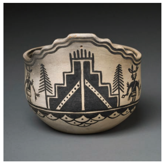
Terraced Bowl with Koshares, ca. 1915, 6 1/4 x 8 inches