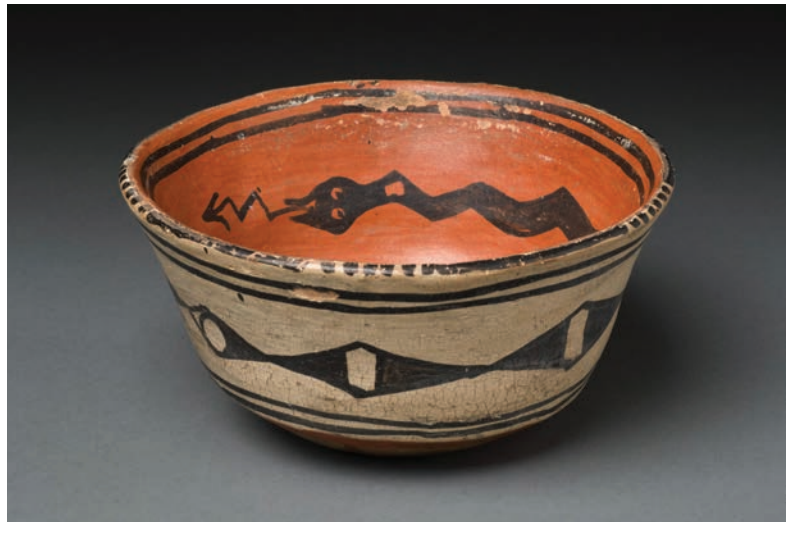
Historic Bowl with Red Interior and Snake Design, late 19th century, 4 x 7 1/2 inches