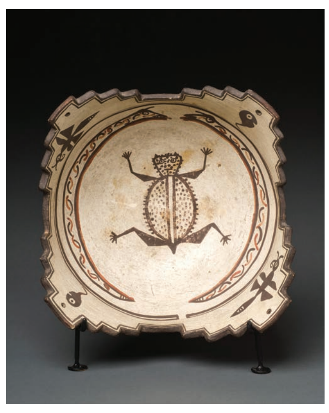
Terraced Kiva Step Bowl, late 19th century, 5 x 9 inches

Located some 40 miles south of Gallup, New Mexico, Zuni Pueblo is more remote than the other Pueblos. Zuni potters demonstrate a preference for sculptural pieces with water and hunting symbols such tadpoles, heartline deer (an open-mouthed deer with an arrow extending from the mouth to the inside of the animal), and dragonflies executed in a dark brown mineral paint. Clay used by Zuni potters is usually pink, although gray clay is sometimes employed.