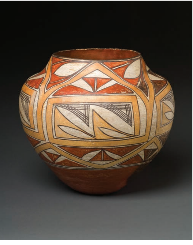
Historic Four Color Jar, late 19th century, 12 x 13 1/2 inches

to sharply contrasting black images as well as polychrome depictions of rainbows, parrots, deer, and floral designs. Notable Acoma potters include Lucy M. Lewis (ca. 1890-1992), considered one of the matriarchs of Native American pottery, and Marie Z. Chino (1907–1982).