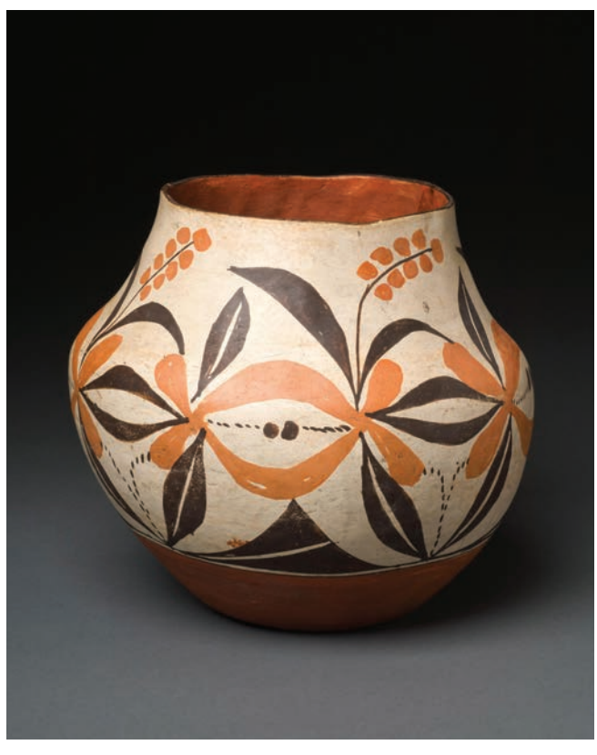
Historic Jar, ca. 1908, 9 x 8 inches

Laguna Pueblo is sometimes considered a "twin" of the better-known Acoma Pueblo (which is located about 16 miles westward), since the two share so many cultural similarities. Potters from both Pueblos, for example, use clay that turns white when fired. What distinguishes Laguna from Acoma pottery are its distinctive large floral designs, executed in both black and terracotta.