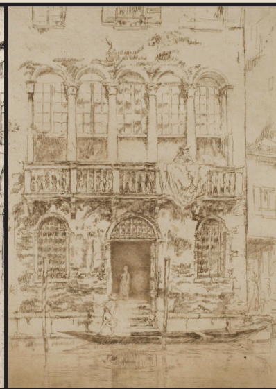
James McNeill Whistler, The Balcony, ca. 1879.