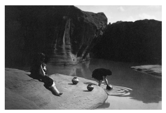
Edward S. Curtis. At the old well of Acoma. 1904. Library of

the war with the trauma of the genocide – or "white witchery" - visited upon Tayo. In the novel, the hierarchical values of Western culture are revealed as having separated humans from the earth since, in this value system, mankind seeks to control nature and all of life's natural processes. Those who embrace Western values thus become "destroyers" of life, according to Silko. Only Congress, LC-USZ62-46879. by rejecting these artificially