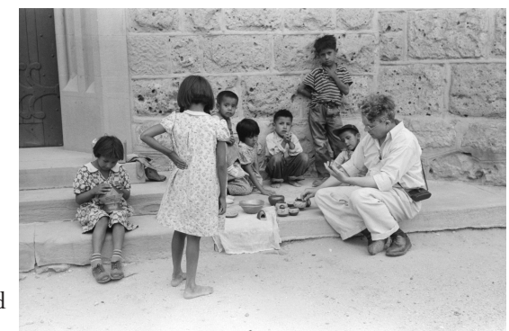
Russell Lee. Tourist buying Indian pottery from children at Tesuque pueblo, New Mexico. 1939. LC-DIG-ppmsc-00193.

Arizona, New Mexico, and Texas. In drawing attention to the historicity of these states in my phrase "in areas that are today," I hope to underscore the fact that Pueblo peoples and Native peoples within the borders of the United States – live in an ongoing colonial relationship with the federal government, and that the geography of the states in which they live were superimposed on them.