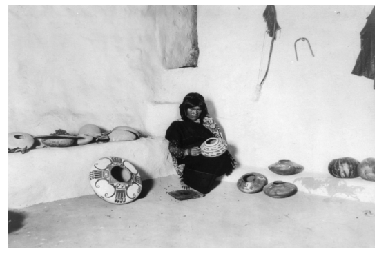
Anonymous. Nampeyo, a noted Tewa Hopi potter of the Hano pueblo in northeastern Arizona, decorating pottery. 1903. Library of Congress, LC-USZ61-2109.

as tourist art. The rest of their value comes from their success as a 'model' ... for the authentic experience the tourist desires." As non-Natives (as most visiting the Bellarmine are) view the art, one could argue that they risk becoming what I will call "visual tourists" only, in essence divorcing the art from its production and cultural context – for all intents and purposes contributing to the erasure of Native peoples.