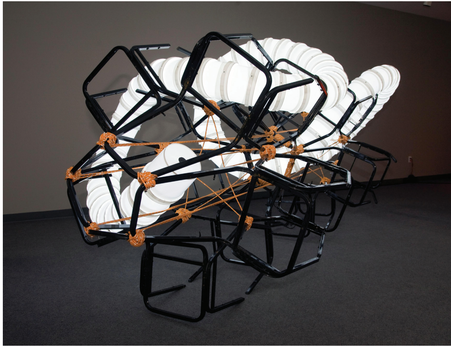
Lighting the five seeds of Chronos, 2014.

undermine or threaten their assumptions of reality. As viewers find repeating patterns of elements and begin to recognize the materials, they move past their unease and become more and more accepting. They can then focus on the appeal of ordinary objects, the malleability of space, and the vitality of the whole. As Peters states: "I can shift the focus from individual pieces to the environment as a whole, helping viewers experience the ways in which my work changes that environment: the spaces in between, surrounding, and within each piece become as important as the works themselves and create a kinetic experience of stationary objects."