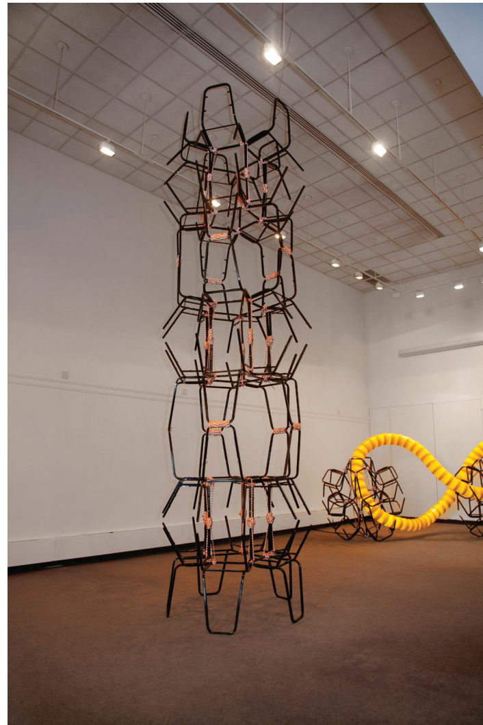
Sumerian Column , 2014.