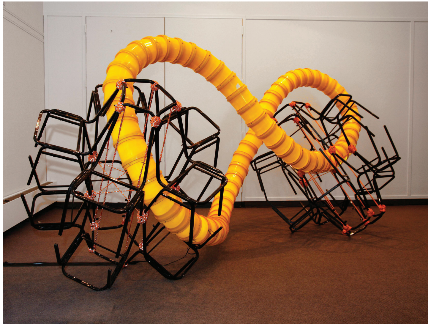
The bond of five Joys , 2014.

For the Walsh Art Gallery project, Peters was asked to respond to the concurrent exhibition in the Bellarmine Museum of Art, La Ragnatela/The Spiderweb: Works by Giampaolo Seguso from The Corning Museum of Glass . This show consists of 33 vases by Seguso (b. 1942), who has continued – and indeed expanded – the centuries-old Venetian tradition of making exquisite blown glass art objects using the filigrana (or “filigree”) technique. This method is distinguished by the use of glass canes, which are melted, stretched, and artfully manipulated, to create decorative patterning. The resulting networks of colored glass are readily apparent in the works on view in La Ragnatela , which is translated as “spider web;” an obvious nod to the related decorative motifs. In these pieces, the linear elements often contrast with areas or bands of color – in large swaths, confined to shapes, or in irregular patterns. Upon first consideration, it is difficult to recognize