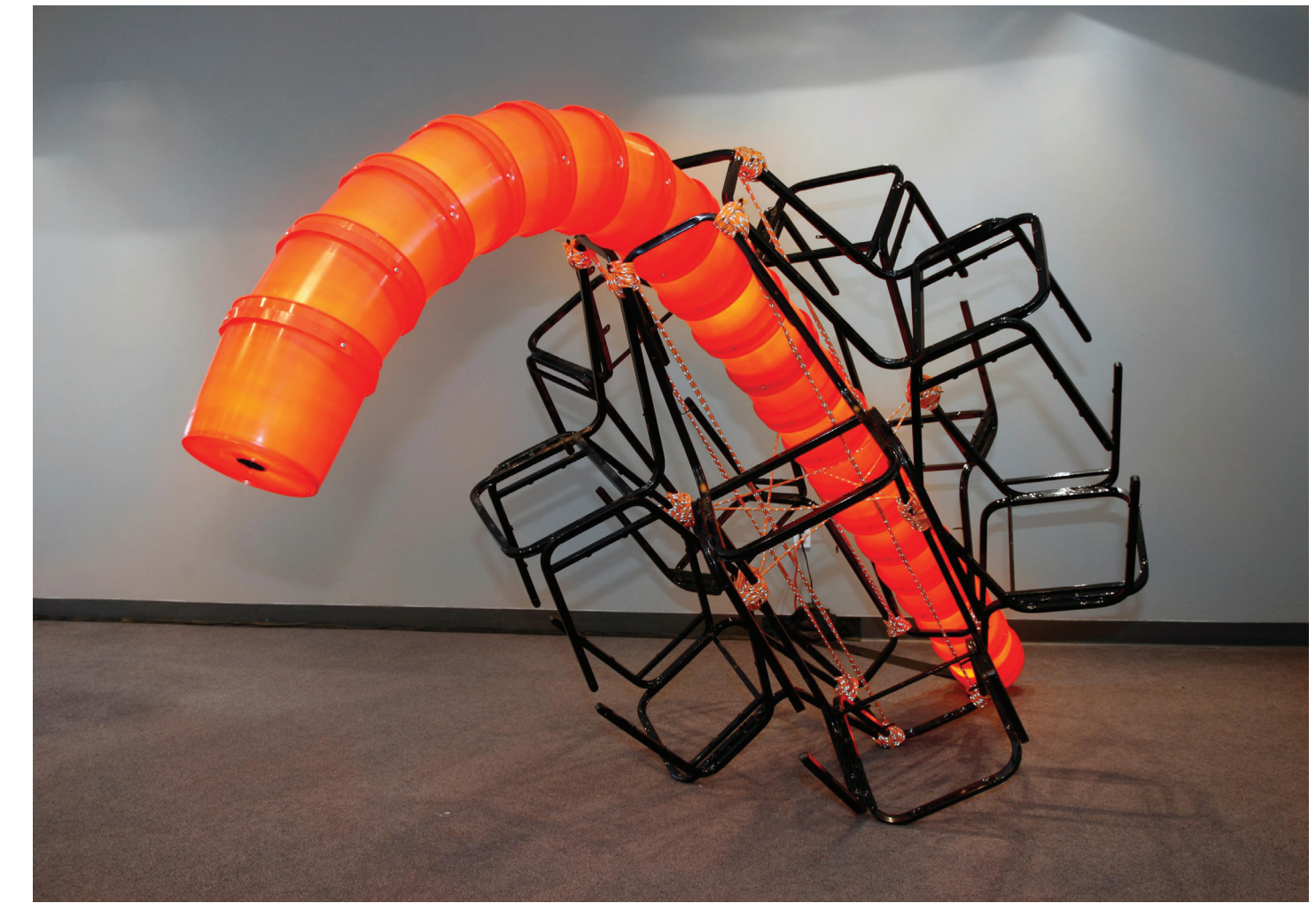
Attempting Neoplatonism , 2014.

Refraction is an intervention in the Walsh Art Gallery, designed to be experienced by viewers walking through the space over a period of time. At first, viewers are confronted with an environment that seems to