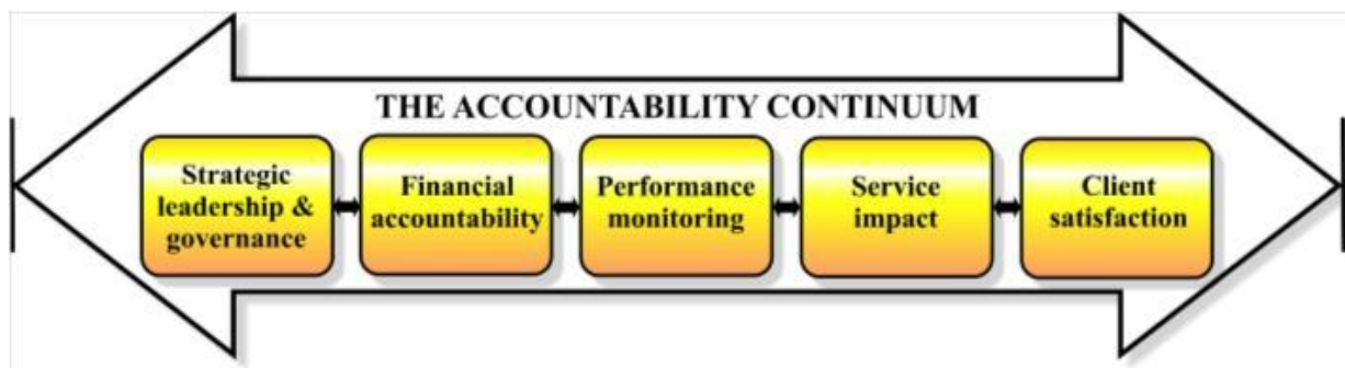
FIGURE 1 THE ACCOUNTABILITY CONTINUUM

Based on: Jamali, Safieddine and Rabbath (2008:445-447) and Swift (2001:16,19-20).