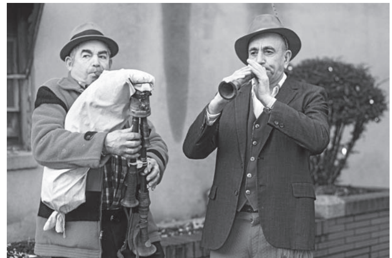
Modern-day Zampognari in the North End at Christmas, 1980