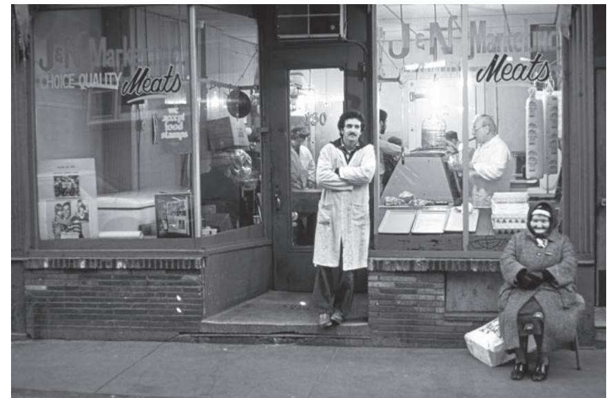
J & N Market, Corner of Prince and Salem Street (North End of Boston), 1980