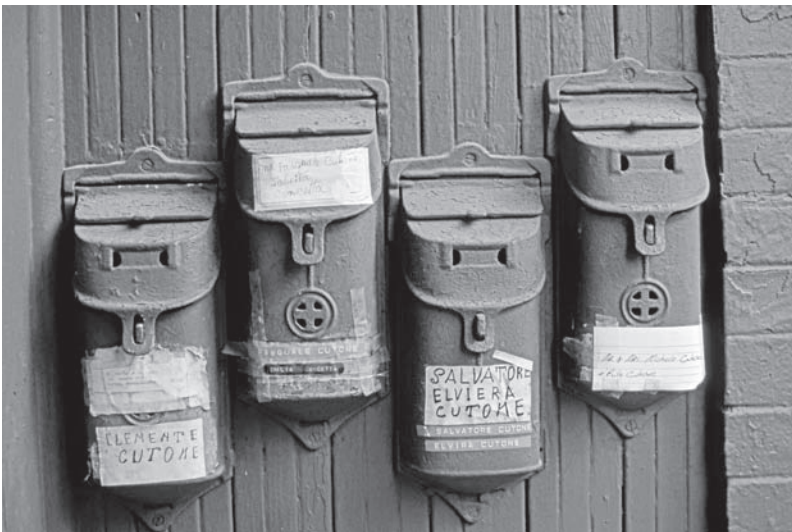
Mailboxes on Cooper Street (North End of Boston), 1981