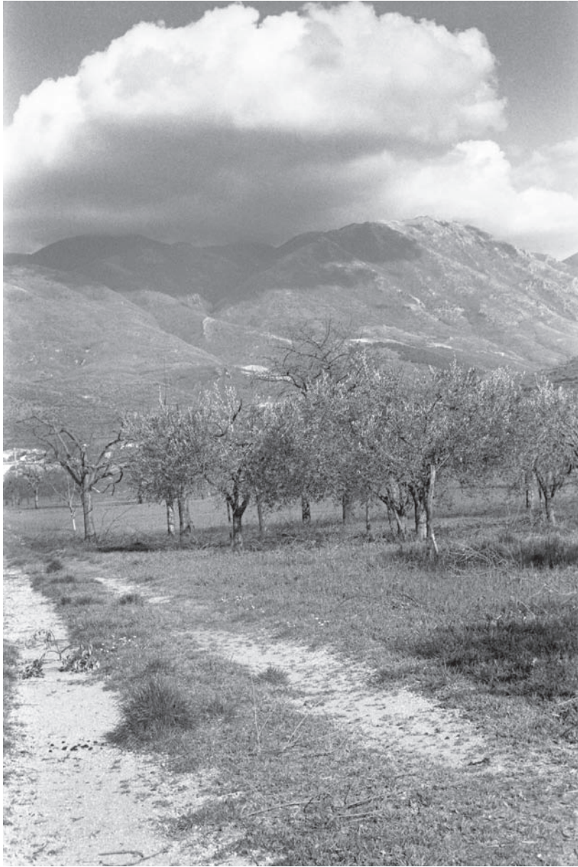
Monte Taburno (Campania), 2009