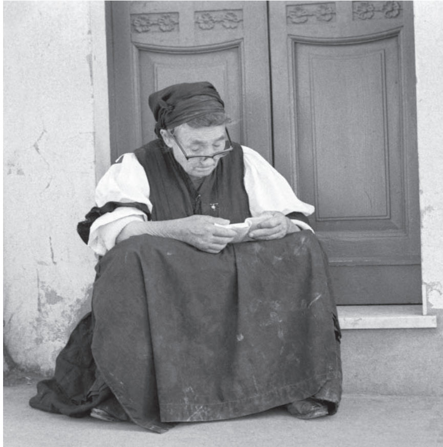
My Daily Prayer (Pisticci, Basilicata), 1975

Assistant Professor of Art History, Fairfield University