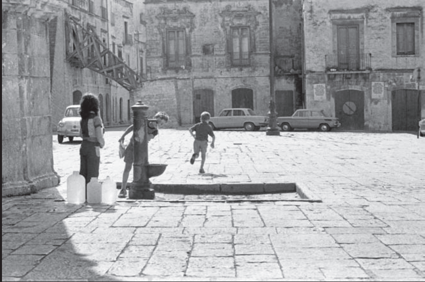
Fountain Place (Bitonto, Puglia), 1975