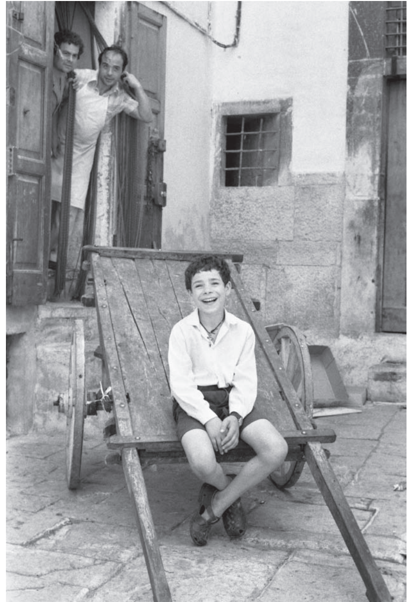
Guaglione (Rome, Lazio), 1975