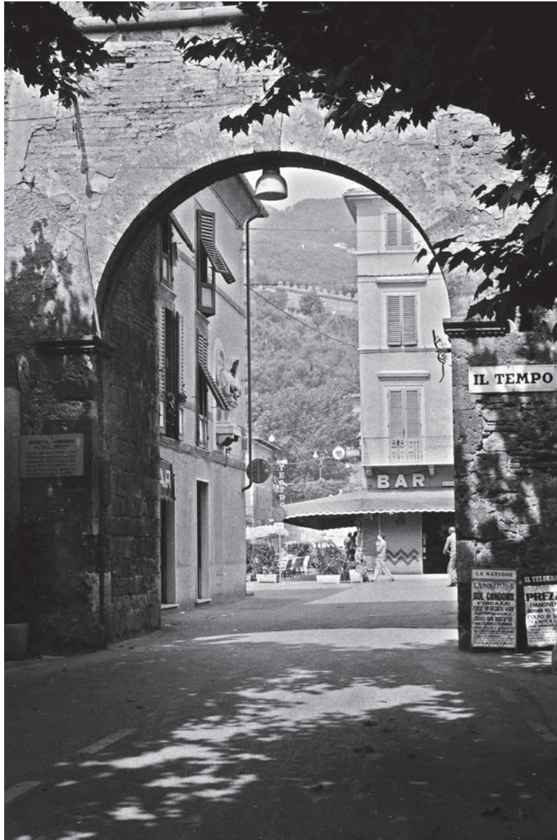
Archway of Pietrasanta (Pietrasanta, Tuscany), 1976