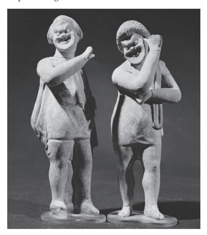
Fig. 2. Terracotta actor figurines, Louvre Museum, Paris.

figurines usually depict the actors wearing or holding dramatic masks, standing as if performing or seated on an altar.