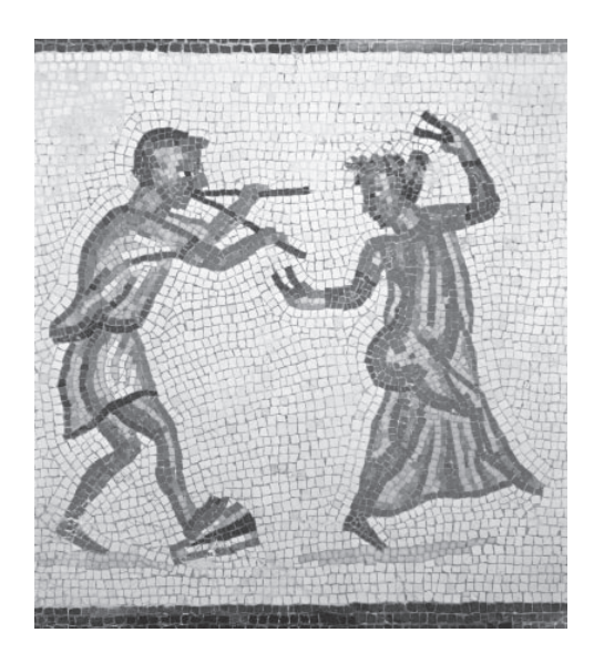
Fig. 4. Roman mosaic, Vatican Museums, Rome.