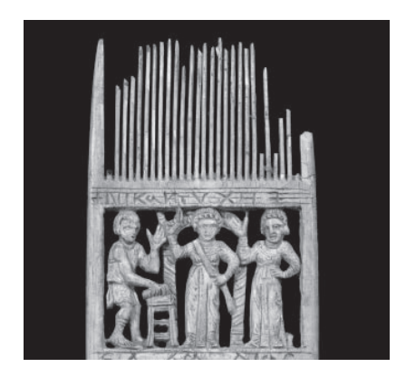
Fig. 6. Ivory comb, Louvre Museum, Paris.

The monumental and ivory mask-gazing images differ from the Boston figurine in that they depict practitioners of "higher" forms of theatrical performance, such as tragedy or pantomime, than the Boston dancer appears to represent. Women did not perform in classical tragedy. The Boston figurine does not represent a pantomime actress either, because her costume is not consistent with that identification. The spectacle of pantomime varied widely, but it is defined by the portrayal of mythological subjects through movement, with voices and music provided by accompanying choruses. 18 Pantomimes performed in public and in private; Pliny reports in Epistles 7.24.4-5 that a woman named Ummidia Quadrillata kept pantomimes (and cared for them more than was appropriate).<sup>19</sup> Evidence for their costume is found in a variety of textual and visual sources, with male and female pantomimes wearing long robes (fringed or embroidered on the edges), scarves, and keeping long, loose hair.<sup>20</sup> Scenes of pantomimes performing appear on fourth and fifth-century contorniate medallions, the sixth-century consular diptych of Anastasius, and a fifth sixth-century ivory comb (Fig. 6).21