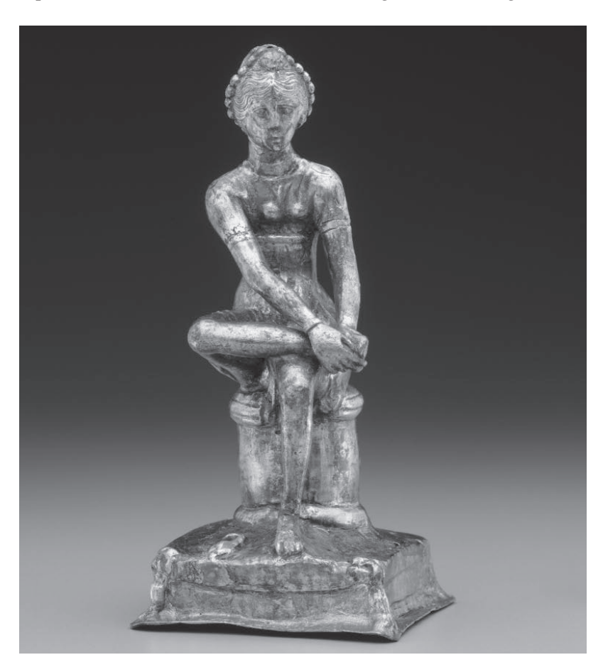
Fig. 1. Silver seated dancer, Museum of Fine Arts, Boston.

late third/fourth-century AD gilded silver statuette (h. 12 cm) in Boston's Museum of Fine Arts depicts a dancer, a woman from the margins of Roman society (Fig. 1). She wears a tight, short, highgirt tunic that leaves her legs and arms bare. Beads adorn her hair, and gold bands encircle her arms and wrists. Seated, she puts on or removes her right shoe with both hands, and gazes forward with a contemplative expression. Although performers appear frequently in Roman art, this is a rare representation of a female entertainer sitting and in a thoughtful mood.