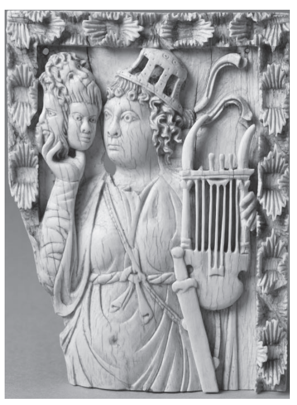
Fig. 5. Ivory relief, Staatliche Museen, Berlin.

The only surviving image of a pensive actress similar in tone to the Boston figurine is a fragment from a sixth-century ivory casket that depicts a serious standing female performer, usually identified as a pantomime, wearing a high-girt garment and holding a sword, a lyre and three masks (Fig. 5).<sup>16</sup>