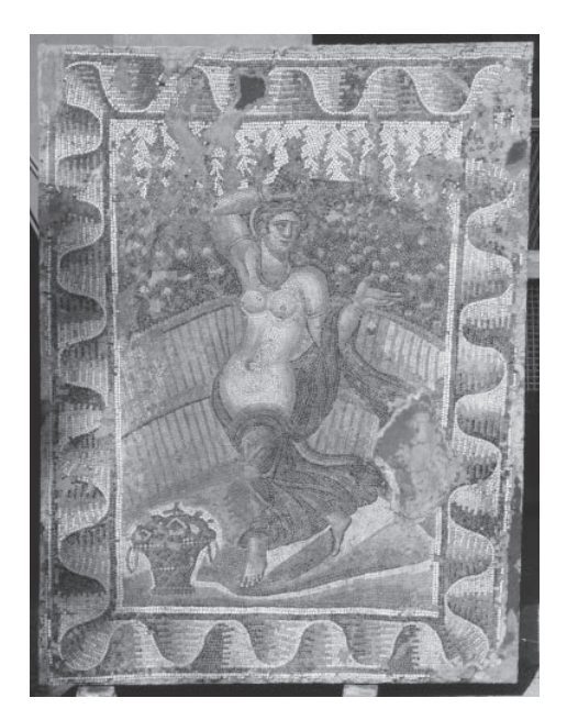
Fig. 3. Roman mosaic, from the villa at Sidi Ghrib, Bardo Museum, Tunis.

mosaics, and small objects such as lamps, continuing a Hellenistic tradition (Figs. 3 and 4). ^{\rm 13}