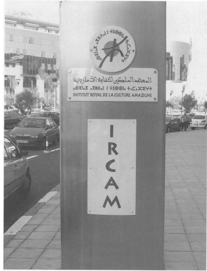
Outside the Royal Institute of the Amazigh Culture, Rabat. PAUL SILVERSTEIN

Boasting an estimated annual budget of $100 million, the institute is temporarily housed in a hyper-modern commercial center located in the posh Rabat neighborhood of Hayy