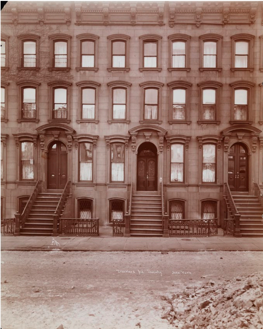
Figure 1. A 1909 image of the exterior of the Travelers' Aid Society Headquarters, located at 238 E. 48th Street.