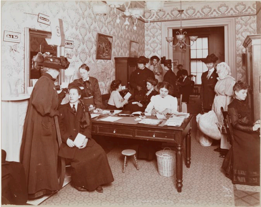
Figure 2. Agents at work inside TAS headquarters in 1909.

TAS workers did not wear uniforms and they were only identifiable by their badges made of ribbon. 39