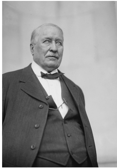
Thomas Benton Catron, 1911.

but fruitlessly up to the last moment. [Democrat] Félix Martínez exhorted the Spanish Americans not to vote for [the Republicans] Catron and Fall; up to the last moment, Thomas B. Catron and his son, Republican Charles Catron, sought to persuade the four votes lacking to fall into line; and others, Republicans, Progressives, Democrats, [and] Spanish Americans, were frantically making a last appeal.” 35