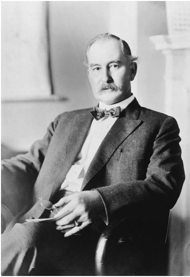
Albert Bacon Fall, c. 1912.