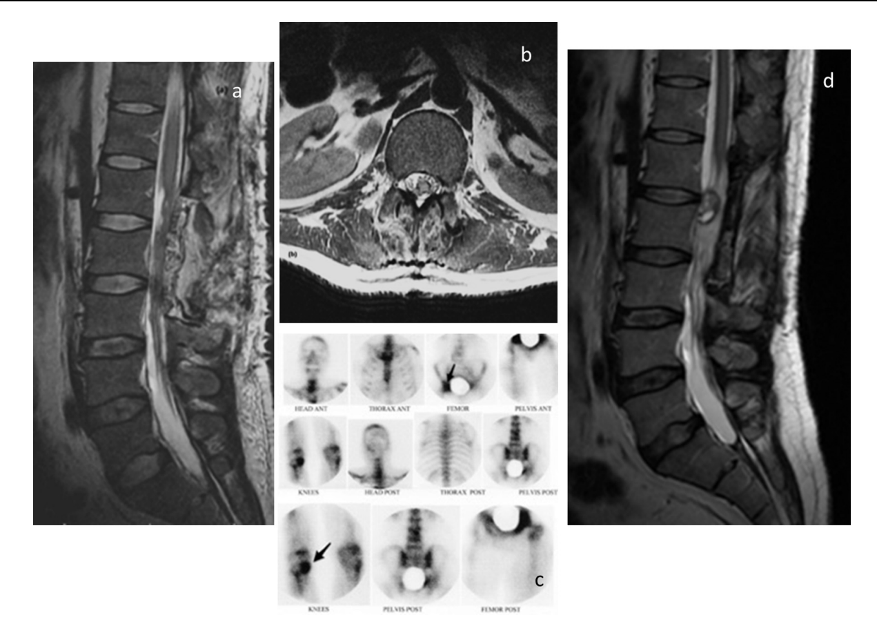
Fig. 2 – (a and b) Postoperative MR images verify the gross total removal of the L2-L3 lesion. (c) 99Tc bone-scan 2 years after the initial diagnosis. The increased technetium uptake (arrows) indicates new metastatic lesions. (d) A 2-year follow-up MRI study shows local recurrence of the sarcoma at the L2-L3 level.

transcript, specific for the Ewing's family sarcomas/PNET. The immediate postoperative contrast-enhanced MRI showed no remaining mass behind the L2-L3 level (Fig. 2a and b). There was impressive relief of the symptomatology after surgery. Subsequently, the patient was referred to the tumor board meeting of our University Hospital for further management, but was not fully compliant with the treatment protocol proposed including radiotherapy and chemotherapy. His treatment was complemented only with chemotherapy (Vincristine, Doxorubicin, Cyclophosphamide-Mesna, Dactinomycin, Ifosphamide-Mesna and Etoposide), which resulted in complete remission of the residual tumor at the L5 level. Imaging follow-up 3 months after surgery showed no evidence of recurrence at any lumbar level, including L5.