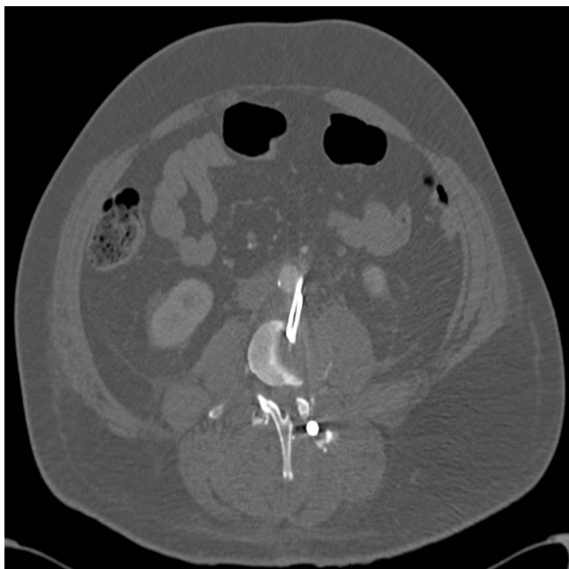
Fig. 1 – Computed tomography scan of the abdomen shows a scalpel, which is located at the level of the lower pole of the kidney.

ligament. Intraoperative radiological imaging revealed that much of the scalpel was in the retroperitoneal region (Figs. 1 and 2). After the lumbar surgery, no sign of significant intraoperative or early postoperative bleeding involving sudden onset bleeding, hypotension, shock and weak or absent pulses in the limb was observed, and hemodynamics were not abnormal. At the first postoperative follow-up,