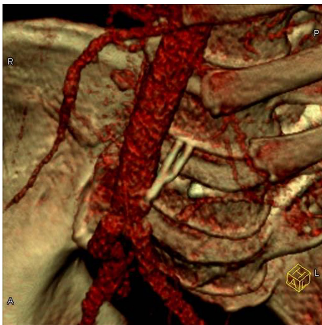
Fig. 2 – 3D-VRT scan. A scalpel is seen next to the left of the abdominal aorta. The rear portion of the scalpel is in intervertebral space.

ligament. Intraoperative radiological imaging revealed that much of the scalpel was in the retroperitoneal region (Figs. 1 and 2). After the lumbar surgery, no sign of significant intraoperative or early postoperative bleeding involving sudden onset bleeding, hypotension, shock and weak or absent pulses in the limb was observed, and hemodynamics were not abnormal. At the first postoperative follow-up,