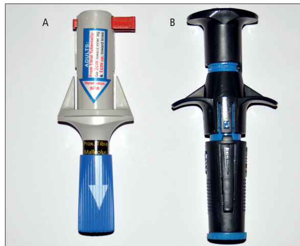
FIGURE 1. Intraosseous access devices used in the study: (A) Bone Injection Gun; (B) NIO Adult Intraosseous device

The present study was approved by the Institutional Review Board of the International Institute of Rescue Research and Education (approval no: