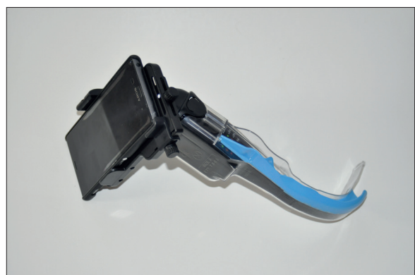
FIGURE 1. Airtraq Avant ® videolaryngoscope

Scenario A: normal airway without continuous CC. Scenario B: normal airway with CC, where controlled continuous CC was applied using the LifeLine ARM mechanical CC system. Chest compression was provided according to current 2015 European Resuscitation Council (ERC) guidelines at a rate of 100 per minute to a depth of 4 to 5 cm.