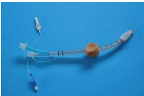
FIGURE 1. CombiTube airway device

One week after the study, participants were asked to secure airway patency with the use of CombiTube during simulated cardiopulmonary resuscitation in the scenarios with and without chest compressions. The order of research scenarios and participants was randomized with the coin tossing method. A detailed randomization procedure for the study is shown on Figure 2. In order to unify the