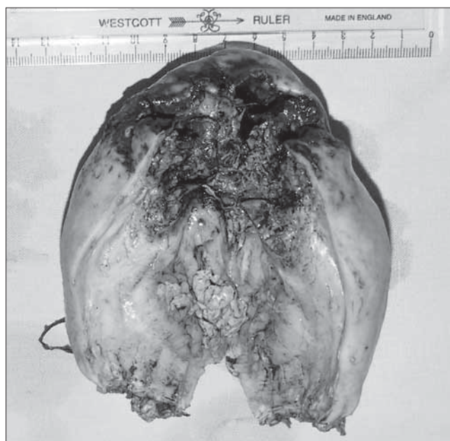
Figure 2. Uterine corpus after dissecting the anterior portion.