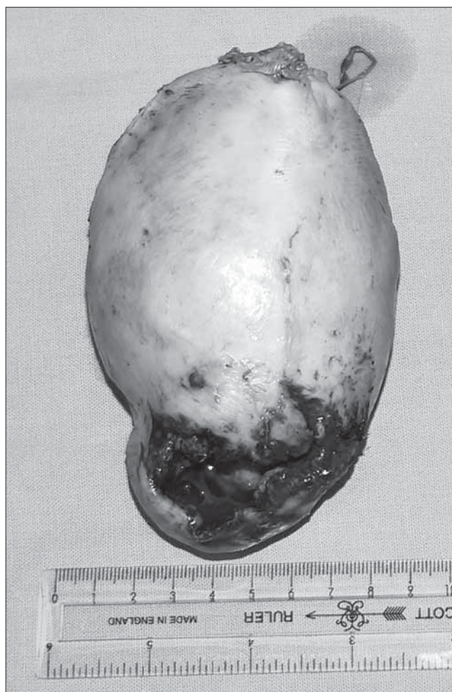
Figure 1. Uterine corpus after supracervical hysterectomy. Rupture was localized in the fundus with protruding regions of invading placenta. Fetus consistent with menstrual age was found delivered into the peritoneal cavity.

In imaging tests, serial transvaginal scans verifying the thickness of lower uterine wall might be of value in women with a history of cesarean section [22]. Suspicious color Doppler results, such as abnormal myometrial periplacental blood flow or the loss of the decidual clear zone between the placenta and myometrium [23, 24], can be verified on MRI ( Magnetic Resonance Imaging ) scan [25].