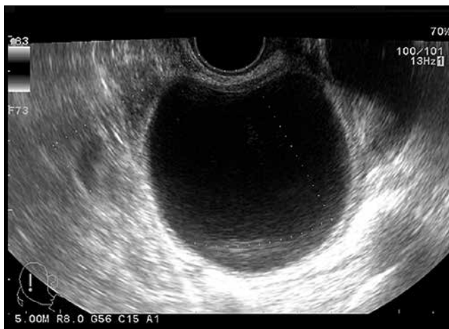
Figure 4. False negative result of ultrasonography in 21-year-old woman with borderline serous tumor.

The second false negative result in the group of premenopausal women was found in a 32-year-old woman admitted to hospital because of a pelvic mass palpable behind the uterus. In ultrasonography it was a bilocular cyst of low-level echogenic content with diameter 8x4.5 cm. Volume of the tumor was 113 cm 3 . It had a smooth, thick capsule (4 mm) and a thick septum (5 mm). The tumor was unilateral and 6 mm of free fluid was measured in the antero-posterior dimension in the pouch of Douglas. In subjective ultrasonographic assessment this tumor was classified as “probably benign”. In the morphological index (SM), however, it had elevated risk because it scored 9 points. In the Doppler index (SD) it was not suspect - 0 points, as it showed only one vessel in the septum, vascularization assessed at 2 points in color score according to IOTA group. (Figure 3).