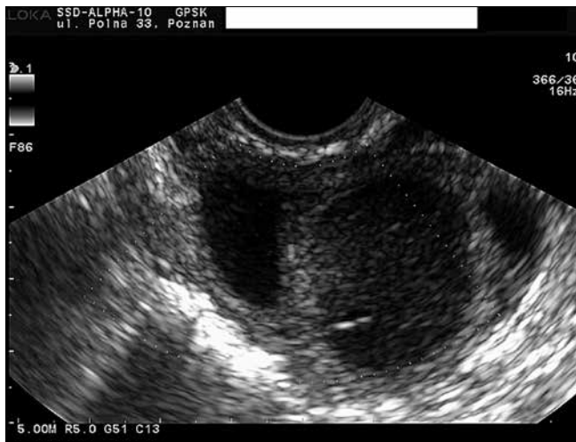
Figure 3. False negative result of ultrasonography in 32-year-old woman with borderline mucinous tumor.