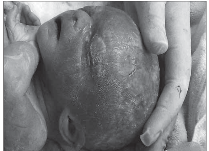
Figure 1. Characteristic facial features, improperly set and maximally rotated ears of the fetus.

According to Polish law, termination of pregnancy after 23 weeks of gestation is forbidden. Nevertheless, amniotic fluid for genetic diagnosis as necessary for future intrauterine therapy is obtainable. We performed evacuation of the cyst and reduction of the ascitic fluid simultaneously. It was not possible to perform amniocentesis due to oligohydramnios. The collected fluid contained fetal cells, which were examined. From cell