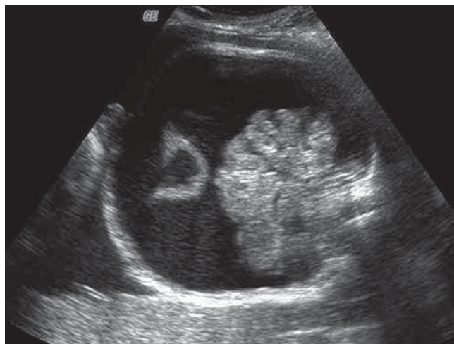
Figure 4. Large ascites of the fetus.