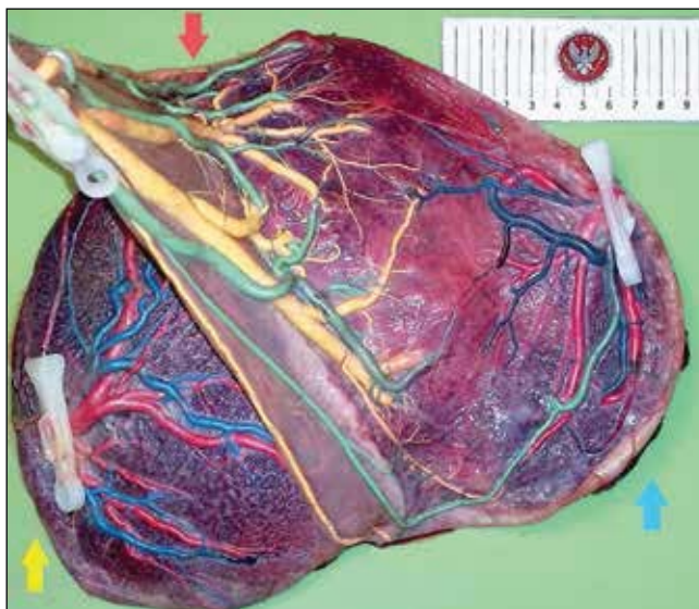
Figure 1. Complete placental mass after post-delivery examination with dye injections. Arteries catheterized and injected with blue and green, veins with red and yellow dye. Arrows indicating every fetus' placenta (fetus II = yellow; fetus I = red; fetus III = blue).

During the caesarean section, each of the umbilical cords was clamped to mark the delivery order. After the delivery, the placentas were stored for a subsequent examination. Umbilical vessels were catheterized and injected with dyes to analyze the