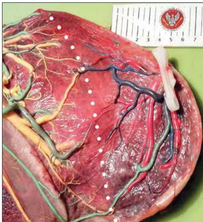
Figure 3. Intertwin anastomoses in monochorionic plate (white spots indicating vascular equator between I and III fetus; colors corresponding to specific type of anastomoses: AA = blue-green; AV = blue-yellow, red-green; VV = red-yellow anastomoses).

Michał Lipa et al. Placental examination with dye injections in post-delivery chorionicity assessment in dichorionic triplet pregnancy.