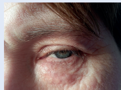
Figure 3. Postoperative day 2. Normal eyelids