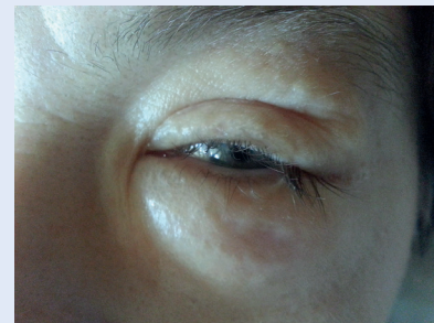
Figure 1. Two hours after the operation. Massive emphysema of both eyelids

Apart from the emphysema there were no other complications. The patient was discharged from hospital on postoperative day three. During the further postoperative period, no symptoms typical for subcutaneous emphysema were observed. In our case, the most likely cause of subcutaneous emphysema were extensive maneuvers of the trocar, that caused subcutaneous