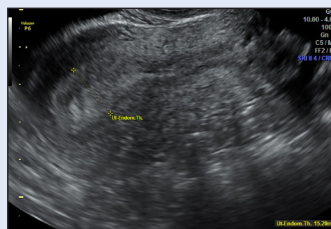
Figure 1. TVUS performed on 10 th cycle day, before hysteroscopy. Endometrium was thickened and heterogeneous.

A 33 year old patient underwent right-sided adrenalectomy because of a non-functional adrenocortical carcinoma (the non-invasive form). After the procedure the patient was qualified for corticosteroid replacement and adjuvant mitotane therapy. After 10 months of treatment menorrhagia occurred. Transvaginal ultrasound (TVUS) was performed (Fig. 1). Due to irregular appearance of the endometrium, the patient was qualified for a hysteroscopy with endometrial biopsy. The histopathological result revealed simple endometrial hyperplasia. After this procedure, menorrhagia did not subside and the patient was hospitalized again with a diagnosis of sideropenic anemia, which required a blood transfusion and intravenous and oral iron supplementation. The lowest haemoglobin (Hb) level was 7.5 g%. To prevent simple endometrial hyperplasia and associated clinical consequences, the patient was qualified for levonorgestrel-releasing intrauterine device (LNG-IUD). The patient was followed-up for 4 years until the end of adjuvant therapy with mitotane. At this time menorrhagia and/or